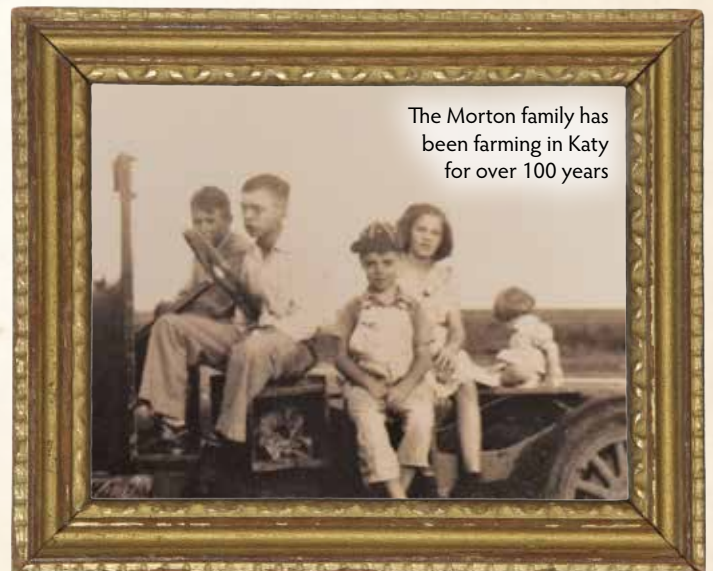
The Morton family has been farming in Katy for over 100 years