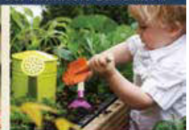
AMS Affiliated Private School