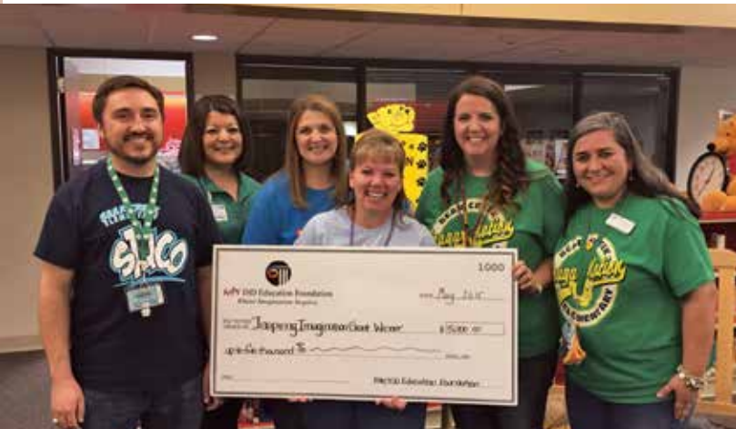
Bear Creek Elementary is awarded the Inquiring Minds Grant