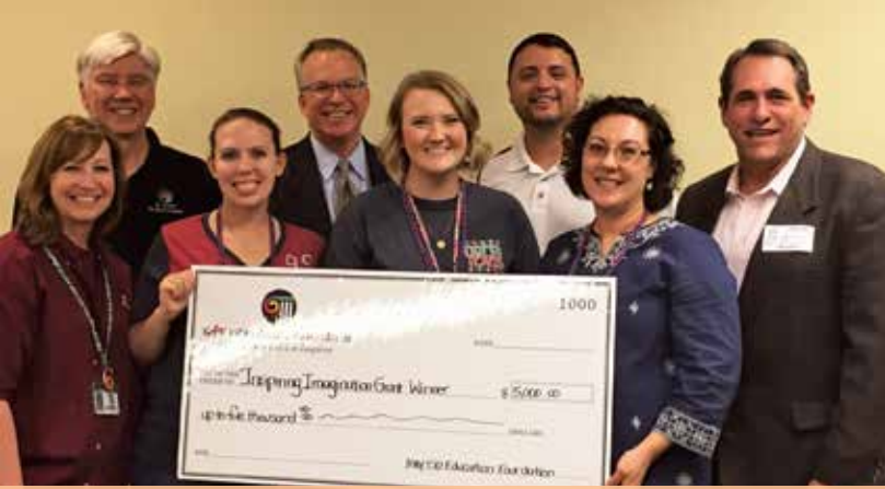
Mayde Creek Junior High winner is awarded a $5,000 grant