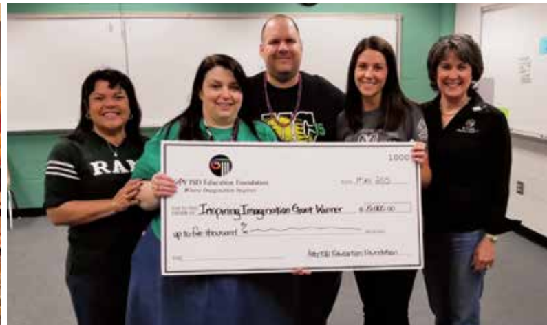
Mayde Creek High School is awarded a grant for their tutoring program, Tools of the Trade

Bright minds often inspire and encourage the creativity of others. Katy ISD Education Foundation's Inspiring Imagination grant program was established to help enrich classroom education for students through the inspiration and creativity of Katy ISD teachers. In the past three years, the Inspiring Inspiration grant program has distributed more than $550,000 in grant awards to Katy ISD teachers. In 2015, Inspiring Imagination awarded grants to 180 teachers and 30 campuses across Katy ISD.