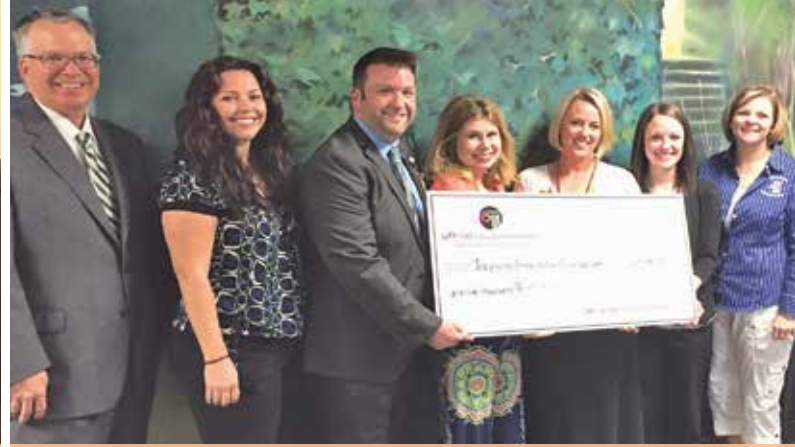
Nottingham Country Elementary teacher is granted up to $5,000 to complete her project