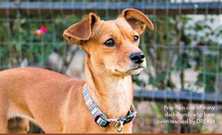
Priscilla is one of many dachshunds who have been rescued by DREAM