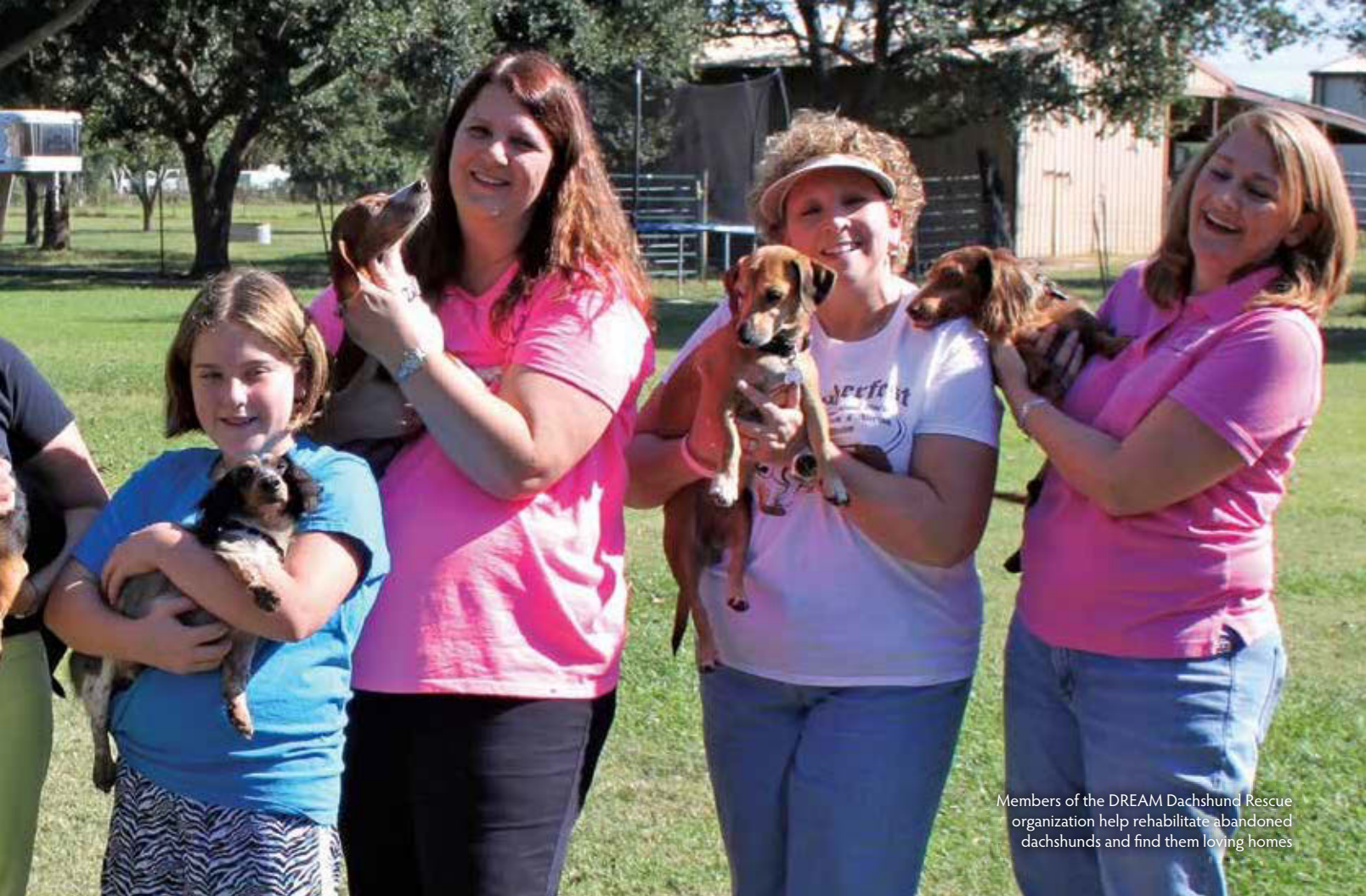
Members of the DREAM Dachshund Rescue organization help rehabilitate abandoned dachshunds and find them loving homes