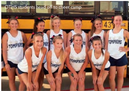
OTHS students head off to cheer camp