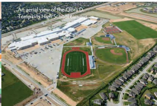
An aerial view of the Obra D. Tompkins High School campus