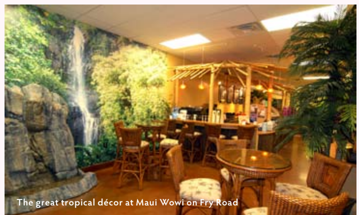
The great tropical décor at Maui Wowi on Fry Road