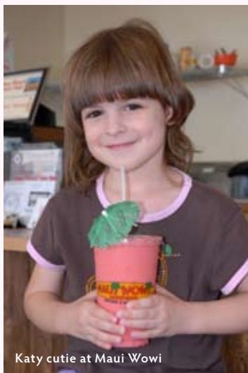
Katy cutie at Maui Wowi

This year Katy welcomes Jamba Juice, now open in the new La Centerra at Cinco Ranch, across from Cinco Ranch High School. Well known for offering highly nutritional products, Jamba Juice mixes some of the best flavors around! Along with the classics, these smoothies can come in a variety of choices to tempt your taste buds. Strawberry Nirvana, Tahiti Green Tea, and Chocolate Moo'd are just a few of the interesting mixes you will find.