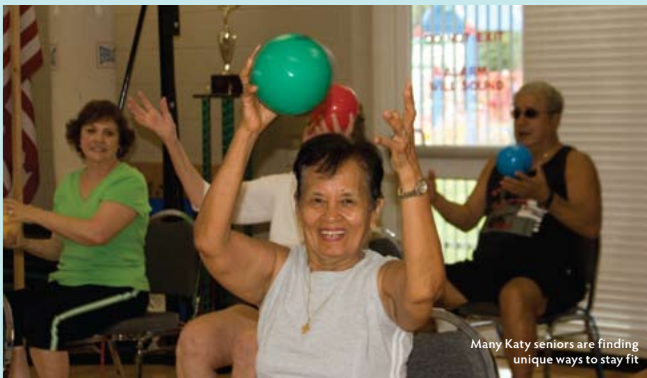
Many Katy seniors are finding unique ways to stay fit