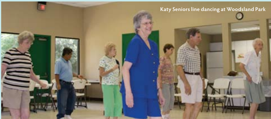
Katy Seniors line dancing at Woodland Park