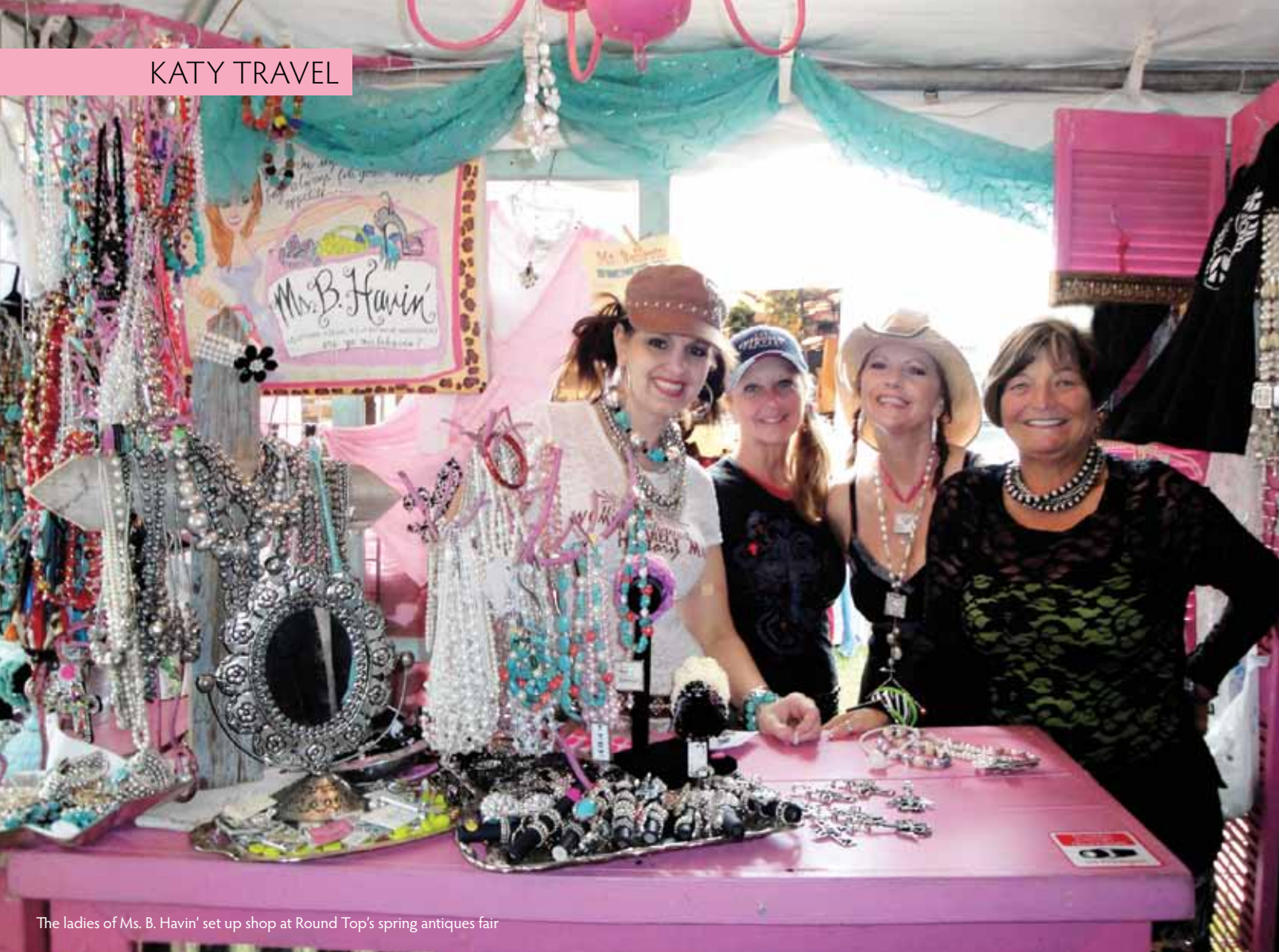
The ladies of Ms. B. Havin' set up shop at Round Top's spring antiques fair