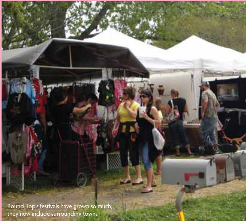
Round Top's festivals have grown so much, they now include surrounding towns