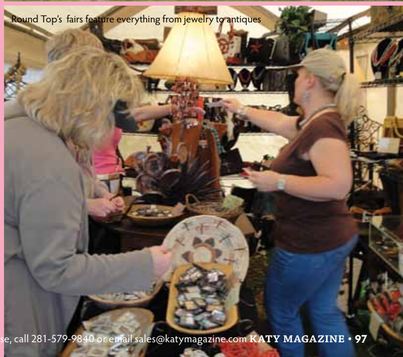
Round Top’s fairs feature everything from jewelry to antiques