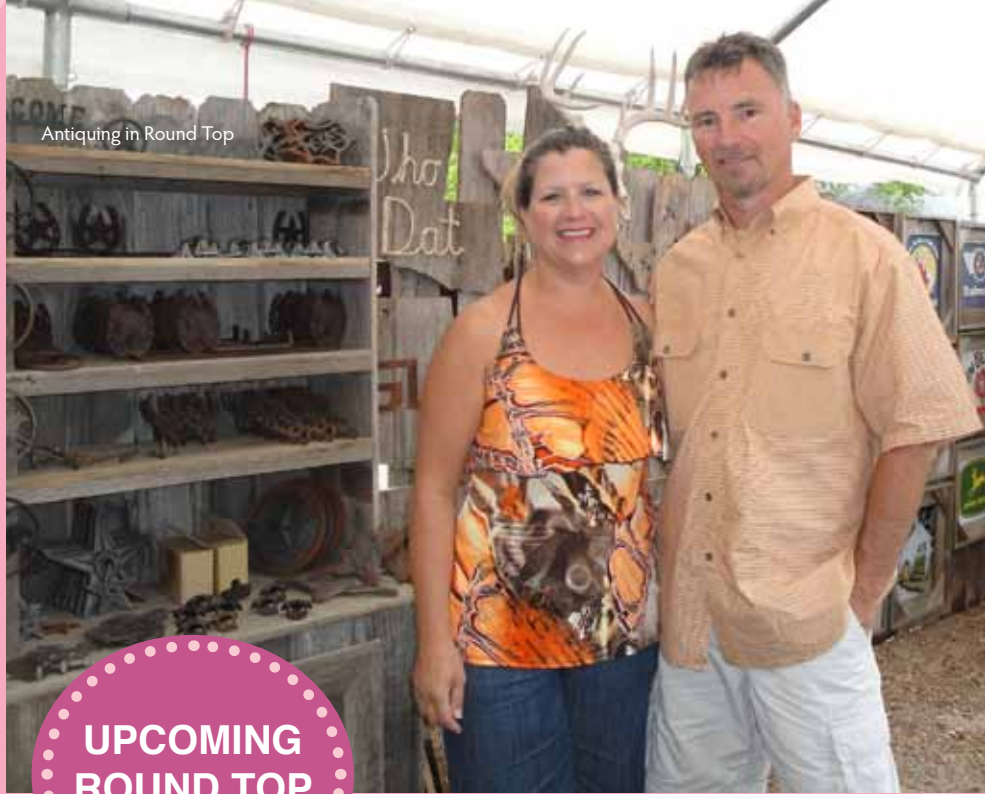
Antiquing in Round Top