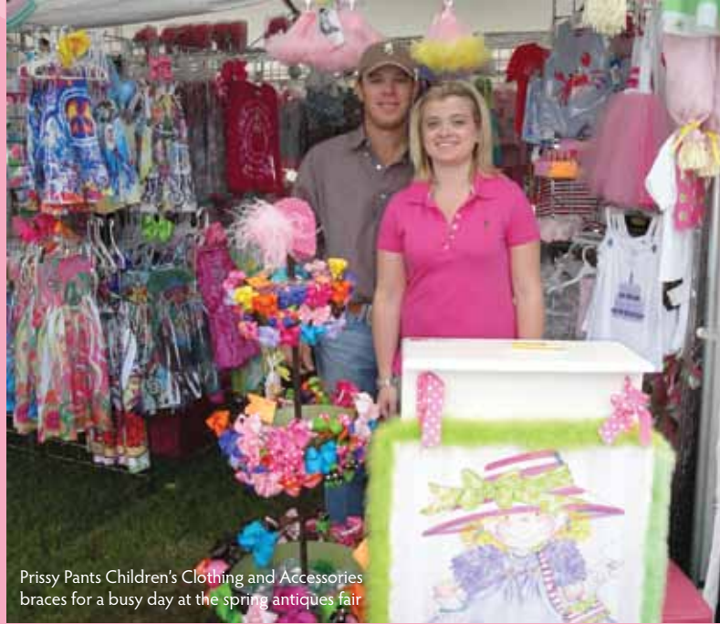
Prissy Pants Children's Clothing and Accessories braces for a busy day at the spring antiques fair