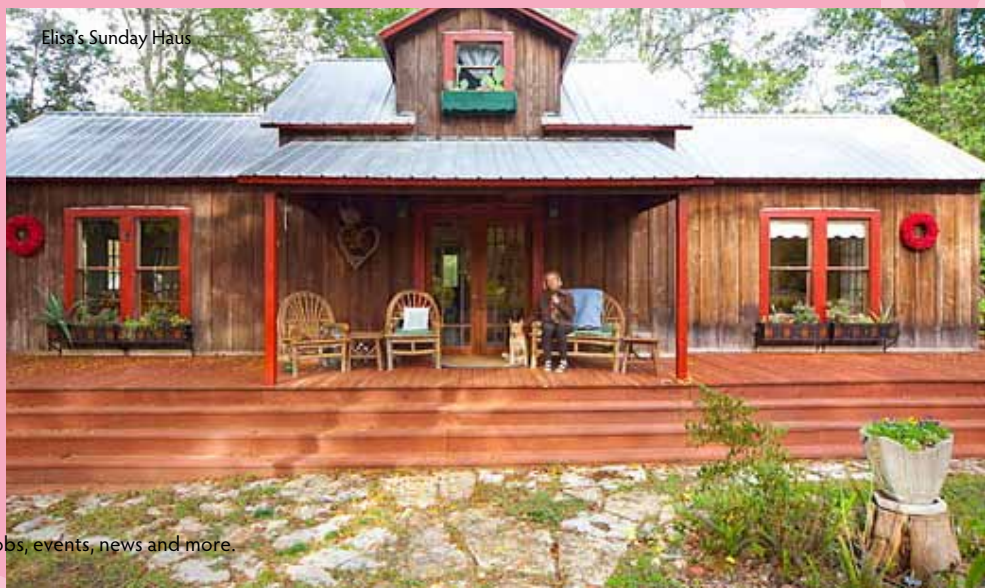
Elisa's Sunday Haus

Discover unique items from arts and crafts to clothing. The annual event encompasses locations in Round Top and surrounding areas.