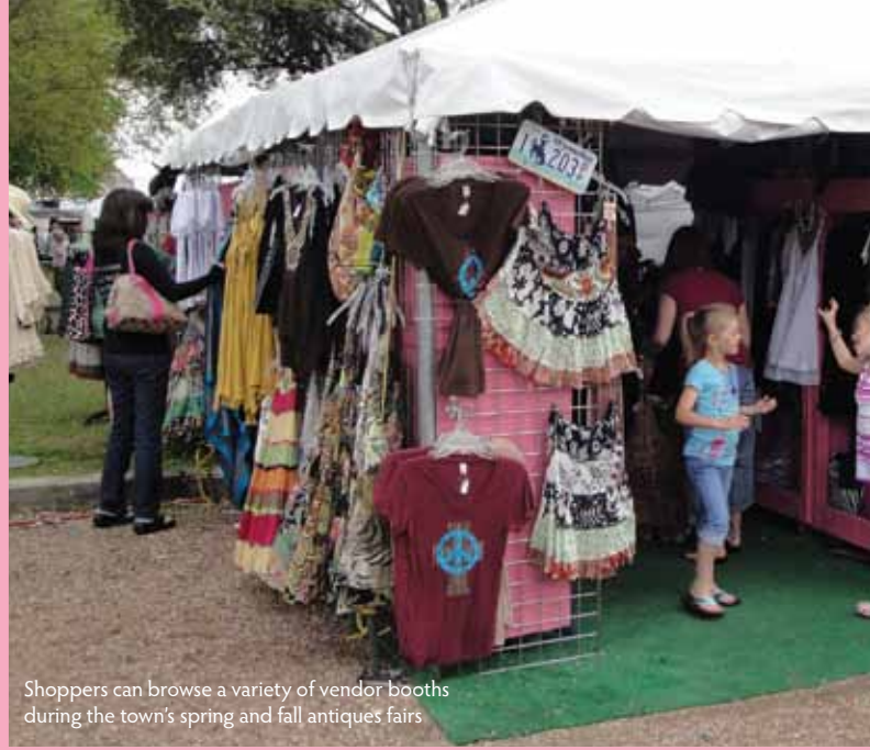
Shoppers can browse a variety of vendor booths during the town’s spring and fall antiques fairs

These festivals have grown so much, in fact, that they now include towns within a 10-mile radius of Round Top.