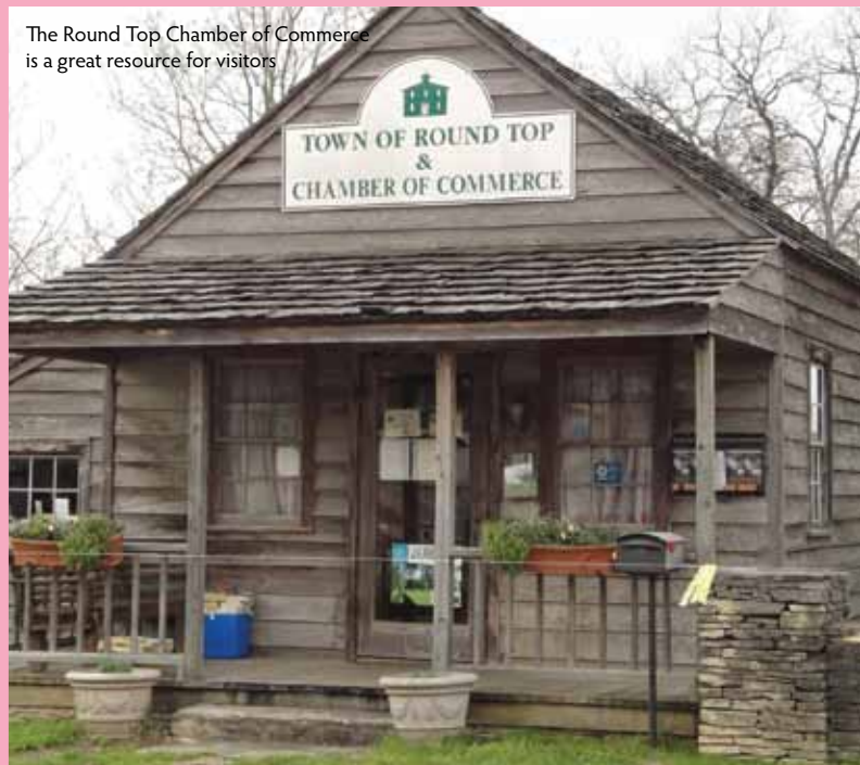
The Round Top Chamber of Commerce is a great resource for visitors