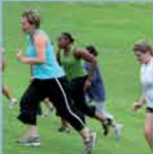
Sport Drills & More