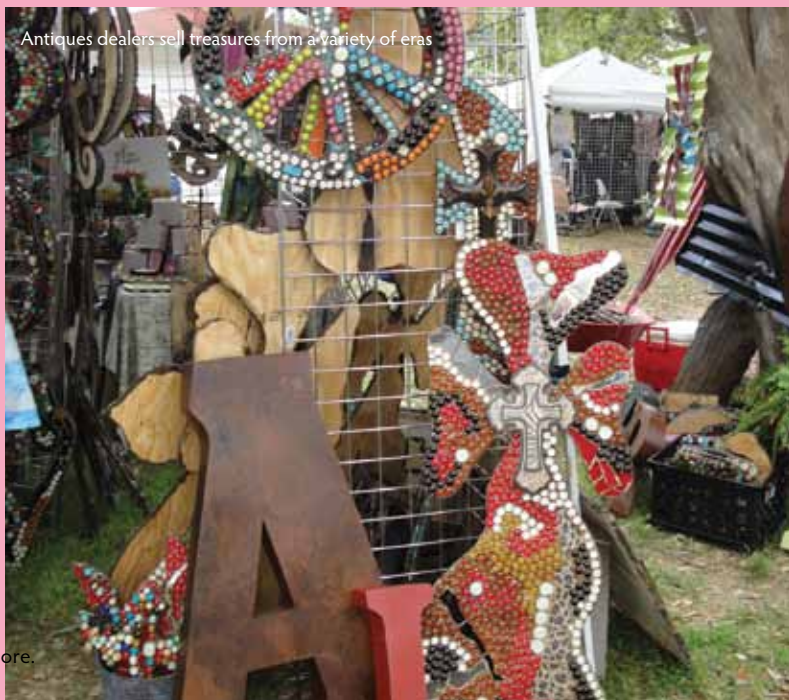
Antiques dealers sell treasures from a variety of eras