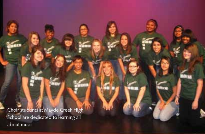
Choir students at Mayde Creek High School are dedicated to learning all about music