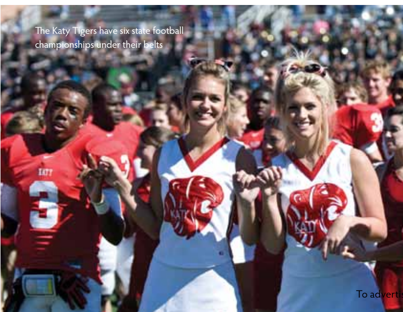
The Katy Tigers have six state football championships under their belts