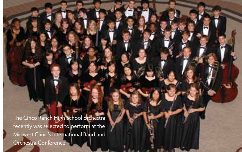
The Cinco Ranch High School orchestra recently was selected to perform at the Midwest Clinic's International Band and Orchestra Conference