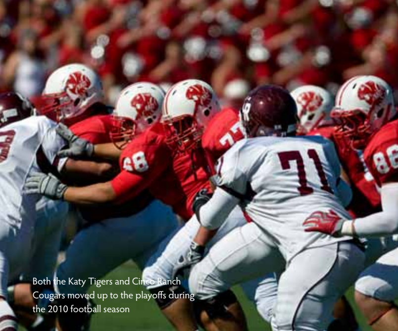
Both the Katy Tigers and Cinco Ranch Cougars moved up to the playoffs during the 2010 football season