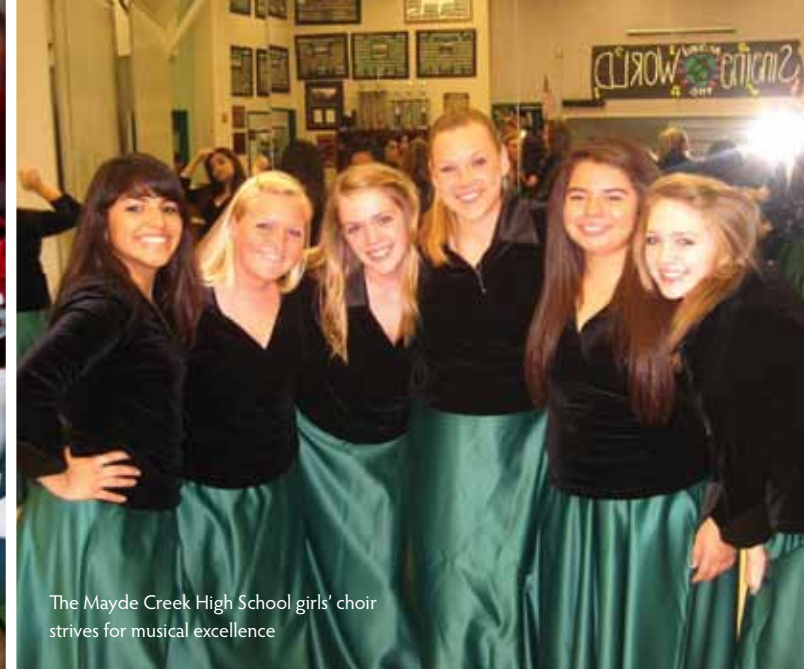
The Mayde Creek High School girls' choir strives for musical excellence