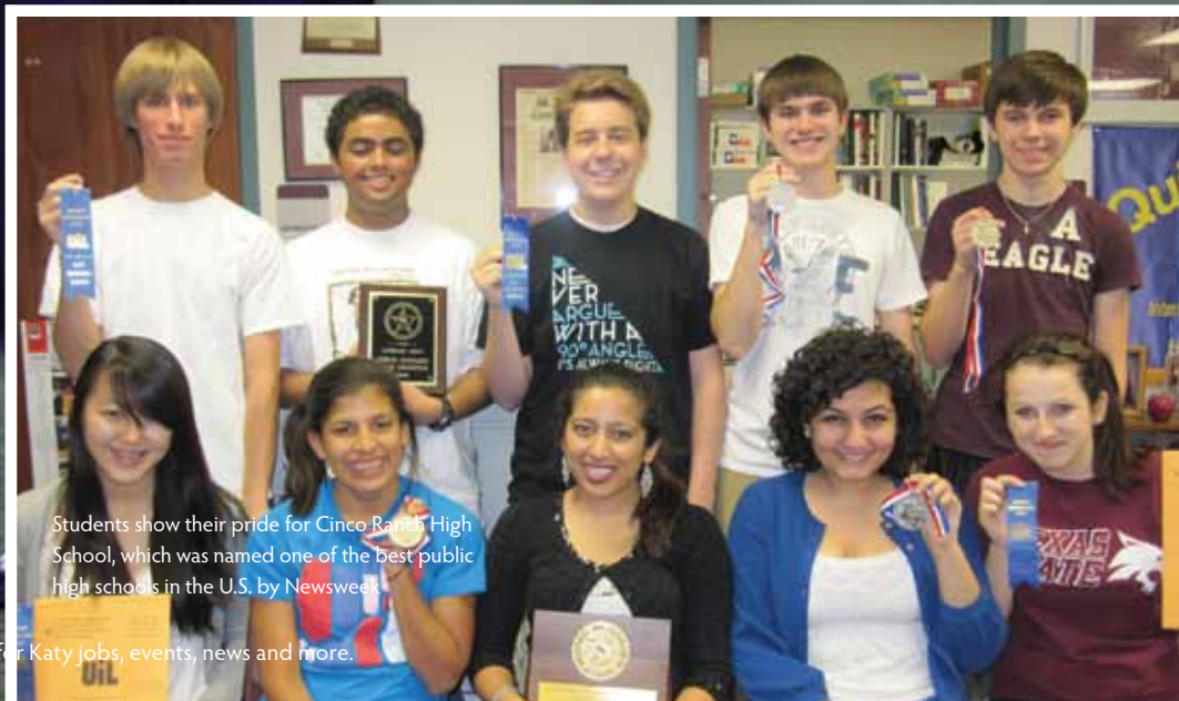
Students show their pride for Cinco Ranch High School, which was named one of the best public high schools in the U.S. by Newsweek