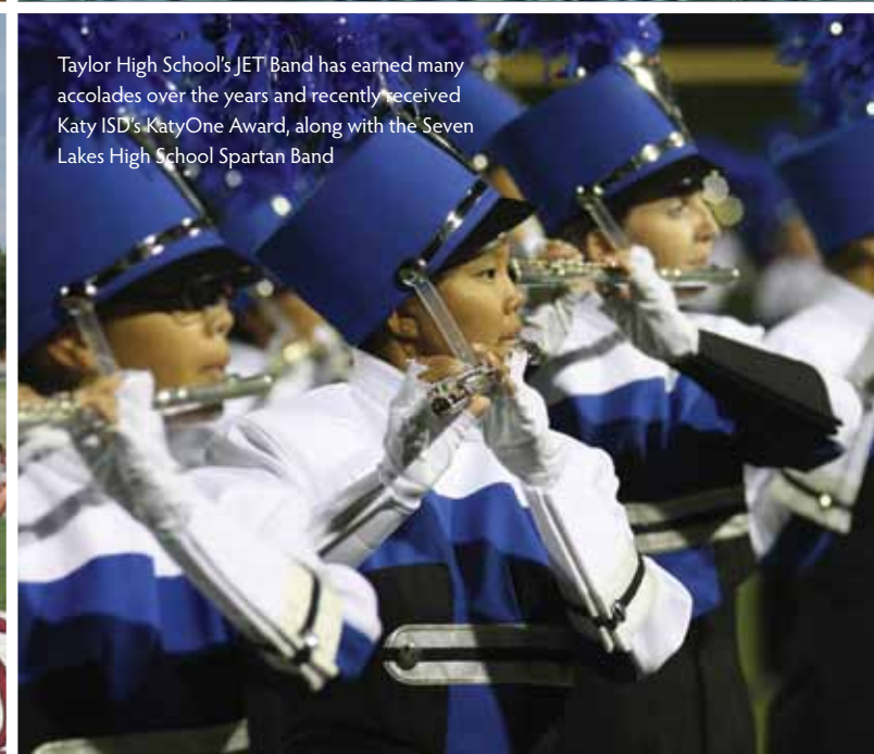
Taylor High School's JET Band has earned many accolades over the years and recently received Katy ISD's KatyOne Award, along with the Seven Lakes High School Spartan Band