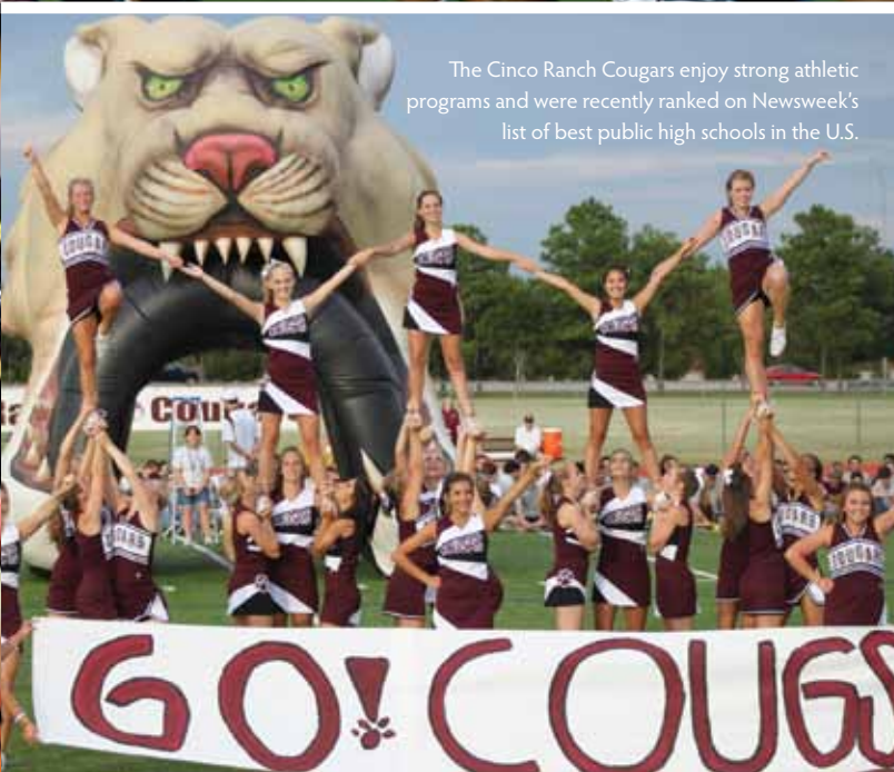
The Cinco Ranch Cougars enjoy strong athletic programs and were recently ranked on Newsweek's list of best public high schools in the U.S.