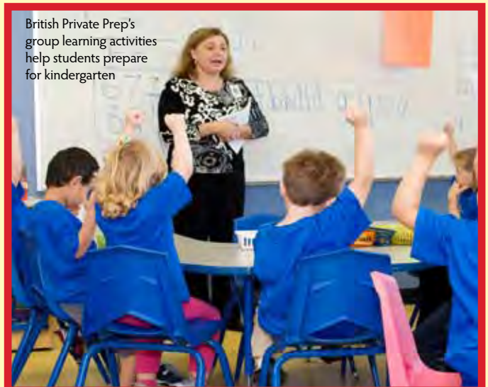
British Private Prep's group learning activities help students prepare for kindergarten