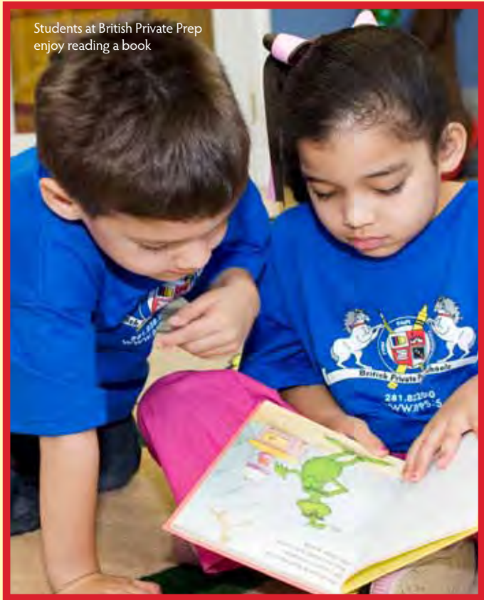
Students at British Private Prep enjoy reading a book

The goal is to prepare the whole child for a lifelong love of learning, while turning them into a well-mannered, trustworthy, responsible member of the community.