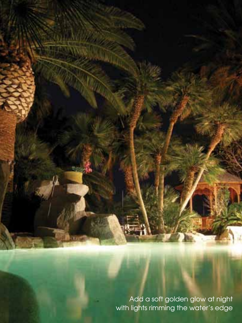
Add a soft golden glow at night with lights rimming the water's edge