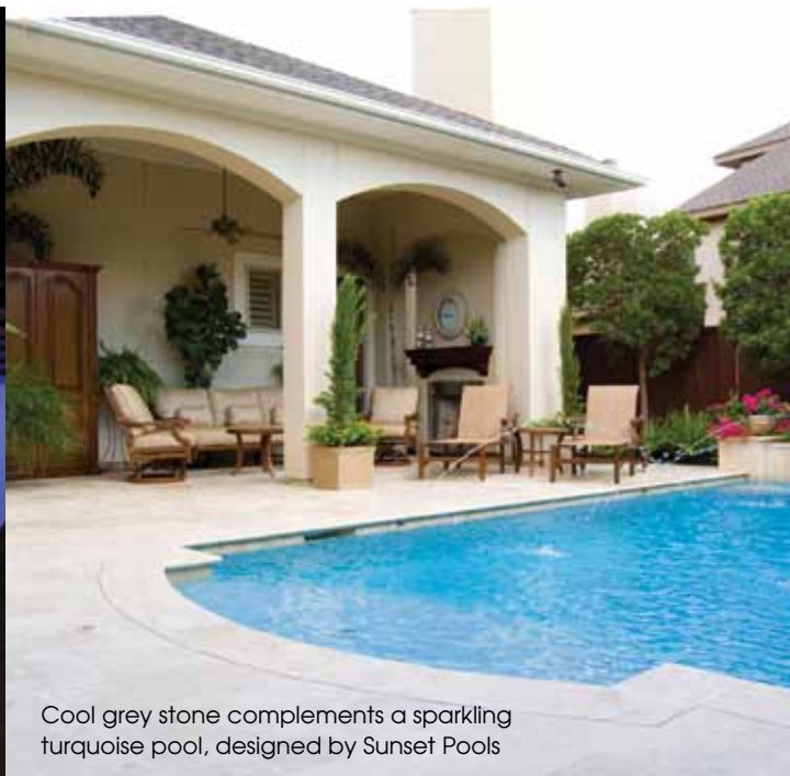
Cool grey stone complements a sparkling turquoise pool, designed by Sunset Pools