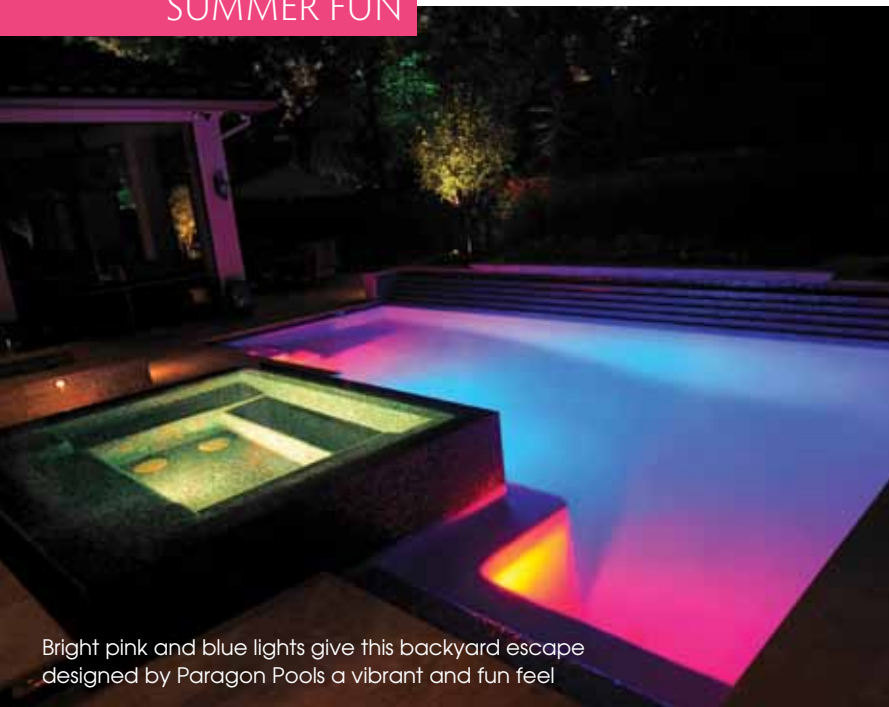
Bright pink and blue lights give this backyard escape designed by Paragon Pools a vibrant and fun feel