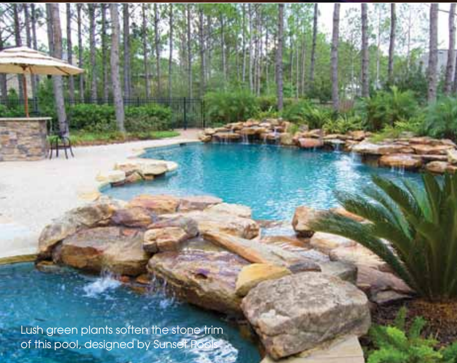
Lush green plants soften the stone trim of this pool, designed by Sunset Pools