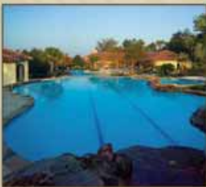
Two resort-style family pools