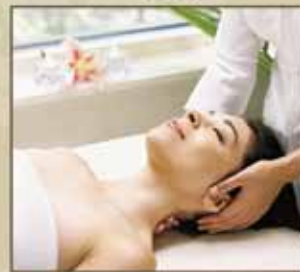
Trellis, a luxurious day spa