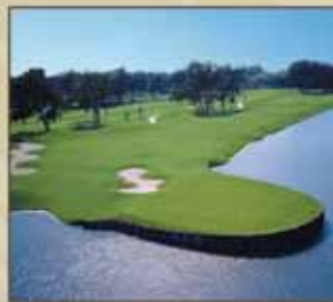
Championship golf course