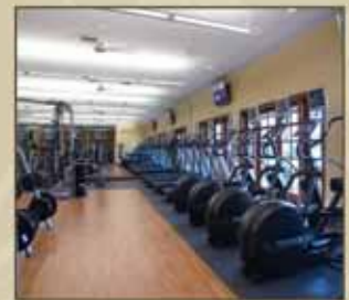
Fitness facilities and programs