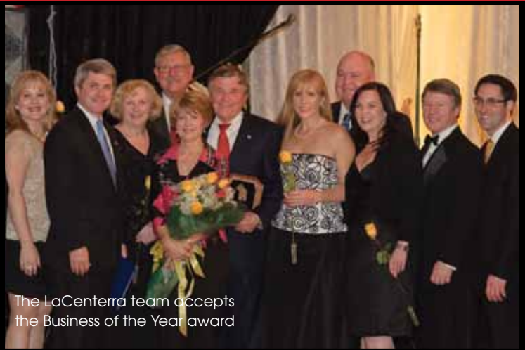
The LaCenterra team accepts the Business of the Year award

Business of the Year LaCenterra at Cinco Ranch