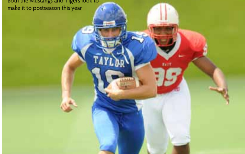
Both the Mustangs and Tigers look to make it to postseason this year