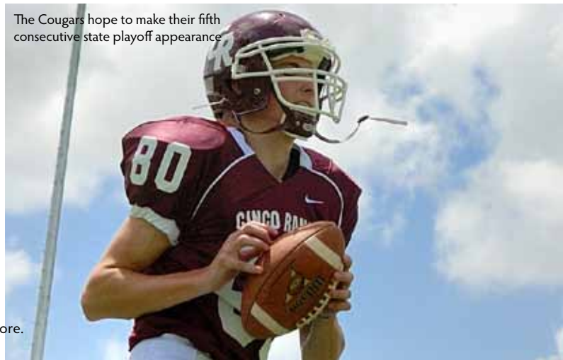
The Cougars hope to make their fifth consecutive state playoff appearance