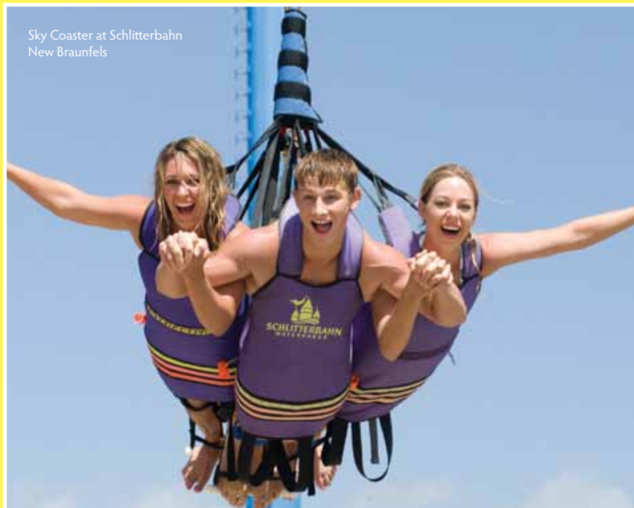
Sky Coaster at Schlitterbahn New Braunfels

White Water Bay at Six Flags Fiesta Texas is gallons of fun for all ages, and is open May 2 to Sept. 7. You'll experience a water wonderland of tubes, rides, and slides, including a massive wave pool in the shape of Texas. Defy gravity as Whirlpool glues you to the wall, pour gallons of water from atop Texas Treehouse, or watch the kids slip and slide through Splashwater Springs. Entry is free with admission to Six Flags Fiesta Texas. One-day admission tickets are $49.99 and $34.99 for children under 48". Children under 2 are free. Purchase your tickets online and pay the kid's price of $34.99. One-day parking is $15. Season passes and group rates are also available.