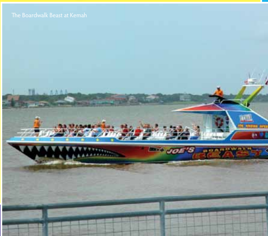
The Boardwalk Beast at Kemah

Lost Lagoon in SeaWorld San Antonio is known for its scenic and tropical delights. The attraction boasts crashing surfs, body and inner tube slides, and much more for the entire family. While the adventurous family members enjoy a five-story-high family raft ride, you can sip a cold drink by the coolest lagoon in Texas. Make it a weekend trip, and enjoy the fun with the whole family. Entry to Lost Lagoon is included in admission to the park. Visitors have several options in purchasing tickets. Single day admission is $54.99 for adults and $46.99 for children plus tax. Check online for specials including kid's pricing for adults, 4-pack special, SeaWorld San Antonio Fun Card, and annual passes.