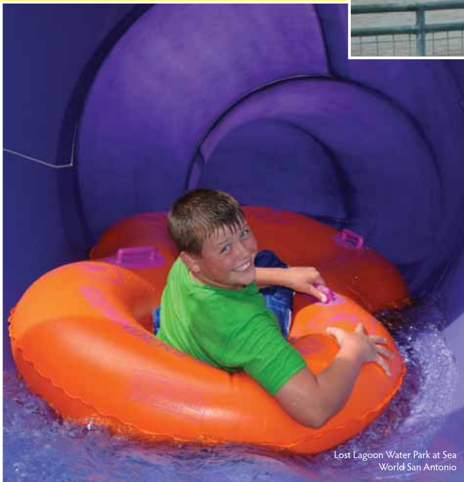
Lost Lagoon Water Park at SeaWorld San Antonio

Featuring a lazy river, Kiddie Cove, waterslides galore, and other wet fun, Splashway is a great place to beat the heat. About an hour's drive away, you can even hook up at their RV Park and make a weekend of it. Park admission is determined by height/age and ranges from $4.99 - $17.99. Discount tickets are available at various outlets. Please visit the website to find the closest location to you. The park opens for its regular season May 30 and closes Aug. 22. KM