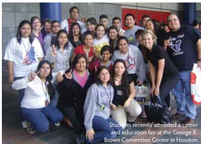
Students recently attended a career and education fair at the George R. Brown Convention Center in Houston