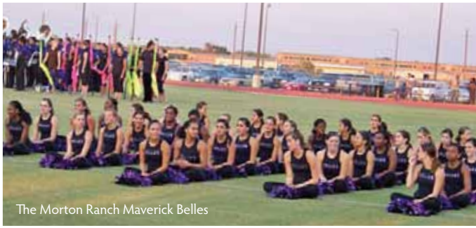
The Morton Ranch Maverick Belles