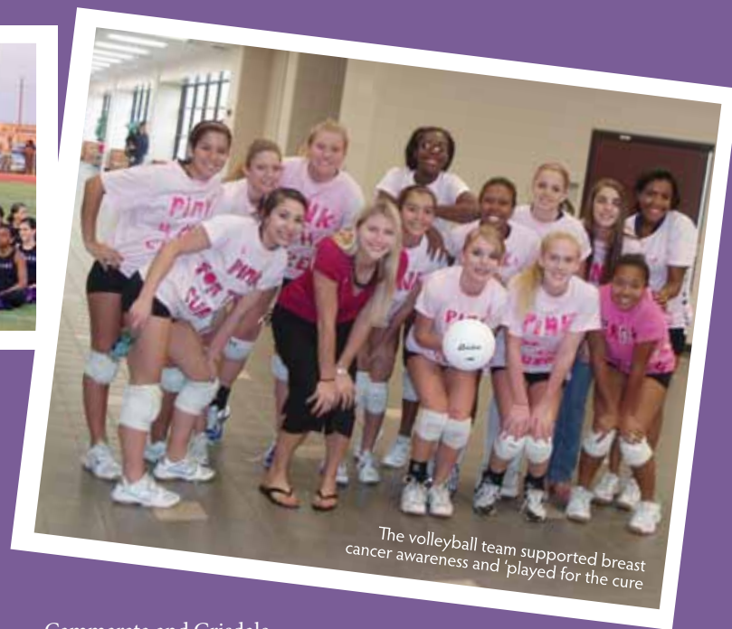
The volleyball team supported breast cancer awareness and 'played for the cure'