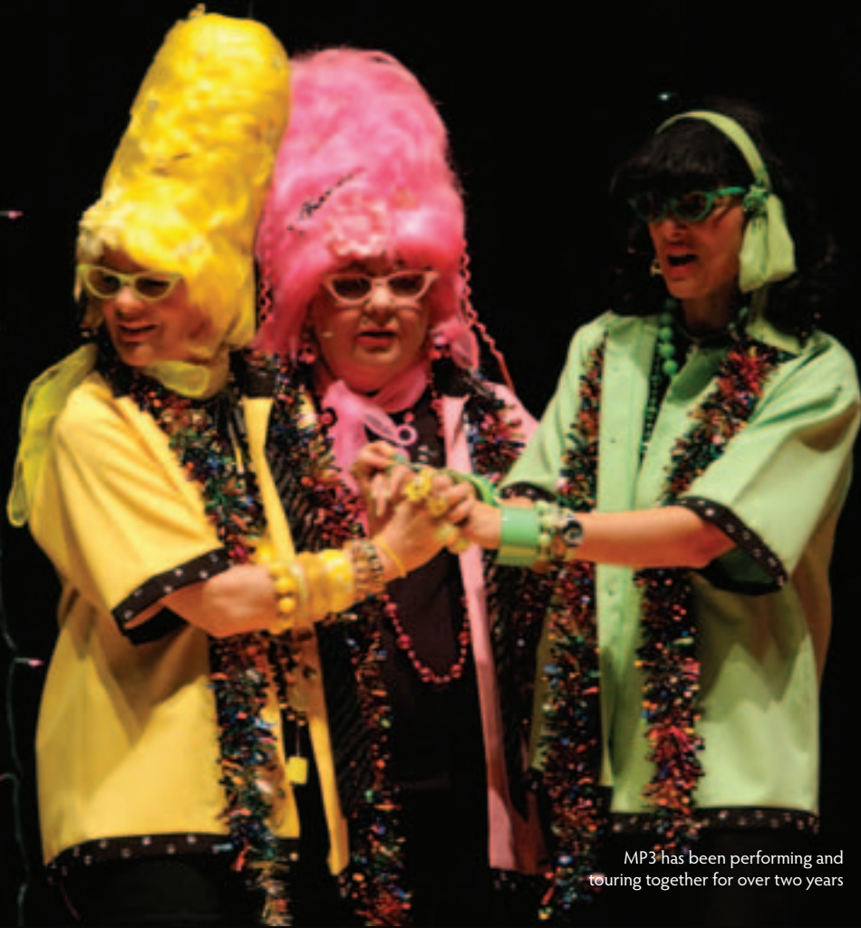
MP3 has been performing and touring together for over two years

“MP3 is a huge surprise in my life. Never in my wildest dreams did I think I would perform zany songs and dances for audiences, especially at this ripe stage in my life.”