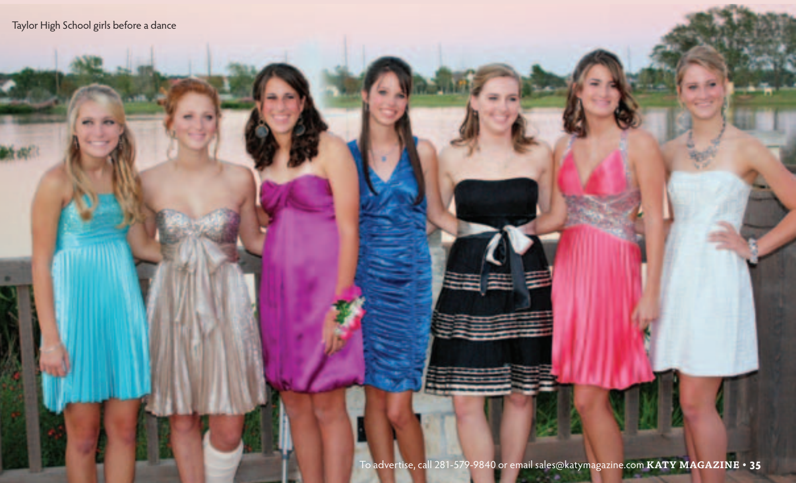
Taylor High School girls before a dance

"Midnight Masquerade" is the theme chosen by Morton Ranch High School Prom Committee for their dance on May 9 at the Merrill Center. Students are encouraged to wear masks in keeping with the theme. As leader of the Senior Class and head of the Prom