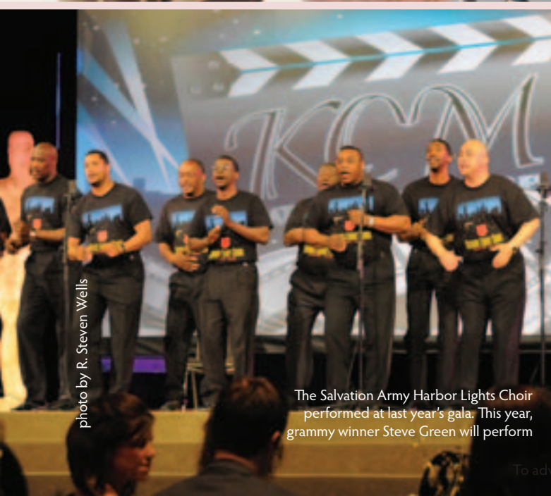
The Salvation Army Harbor Lights Choir performed at last year's gala. This year, grammy winner Steve Green will perform