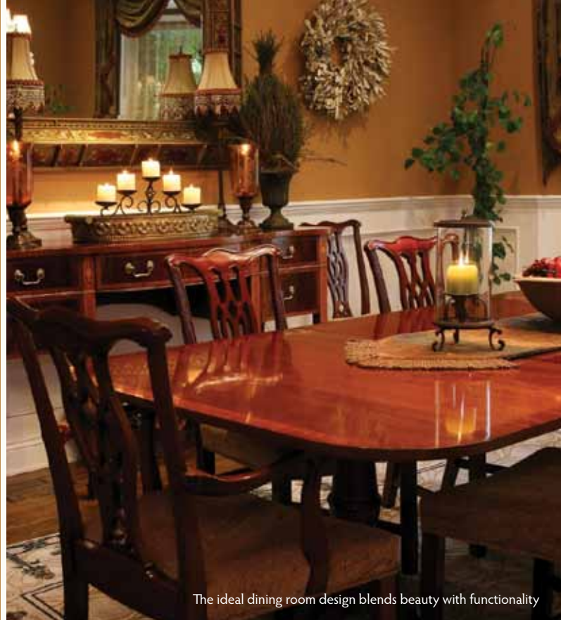
The ideal dining room design blends beauty with functionality