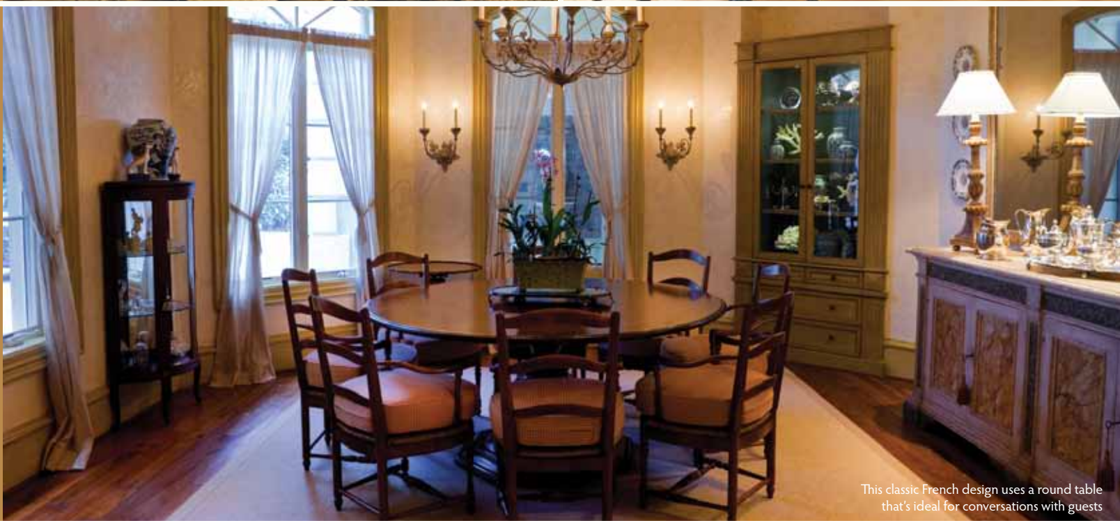
This classic French design uses a round table that's ideal for conversations with guests