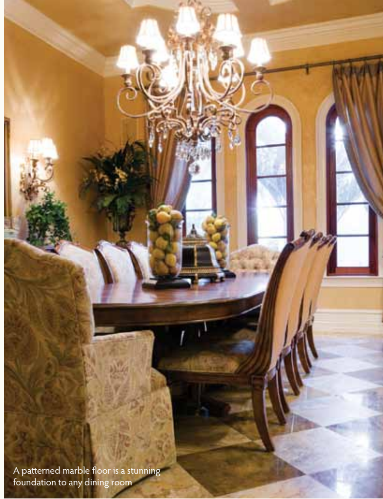
A patterned marble floor is a stunning foundation to any dining room

The purposes of a formal dining room and an everyday breakfast room are uniquely different, impacting your decorating strategy. Breakfast rooms serve a much more common purpose as opposed to formal dining rooms where special occasions take place. Another decorating pointer by Bautista for either room is to not match the kitchen cabinet knobs and other designs special to the house.