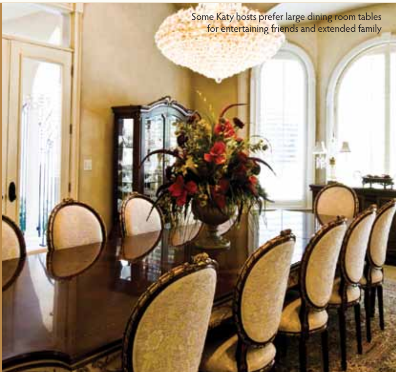
Some Katy hosts prefer large dining room tables for entertaining friends and extended family