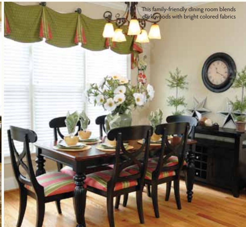
This family-friendly dining room blends darkwoods with bright colored fabrics