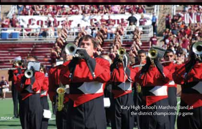
Katy High School's Marching Band at the district championship game