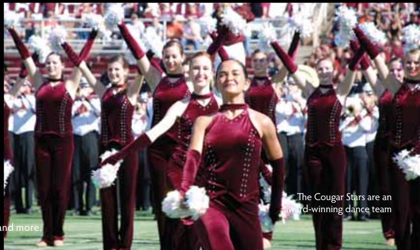
The Cougar Stars are an award-winning dance team