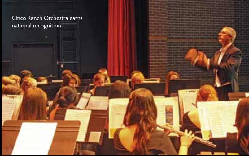
Cinco Ranch Orchestra earns national recognition