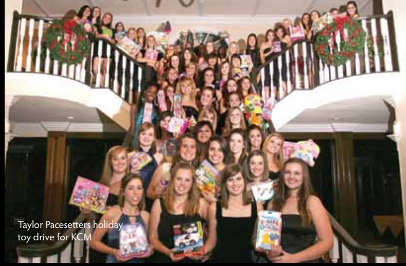
Taylor Pacesetters holiday toy drive for KCM