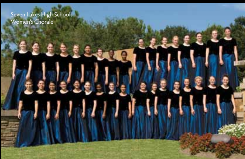
Seven Lakes High Schools Women's Chorale