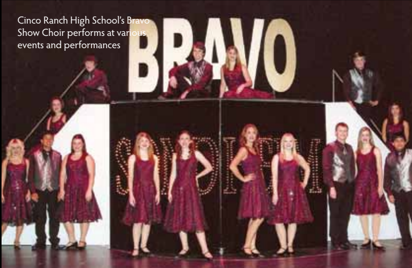
Cinco Ranch High School's Bravo Show Choir performs at various events and performances