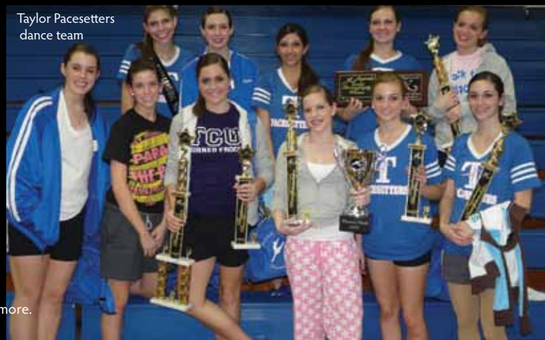
Taylor Pacesetters dance team