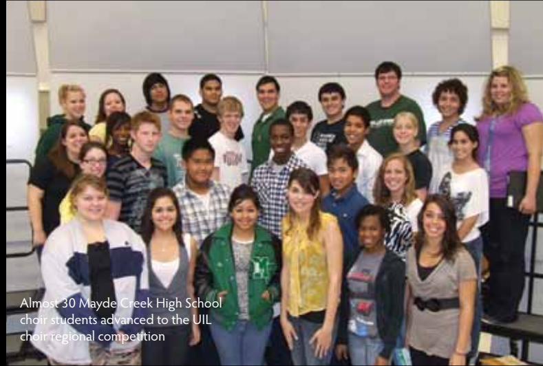
Almost 30 Mayde Creek High School choir students advanced to the UIL choir regional competition