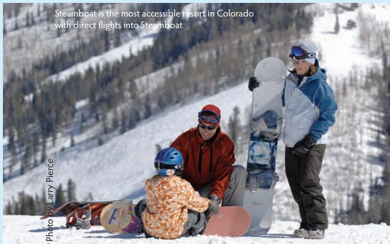
Steamboat is the most accessible resort in Colorado with direct flights into Steamboat

When it’s time for a ski break there’s snow shoeing, horseback riding, gondola rides up the mountain, ice fishing, sleigh ride dinners, dog sled rides to the natural hot springs park, and more. “In downtown, you can watch ski jumping at Howelson Hill. The kids love this,” says Sharon.