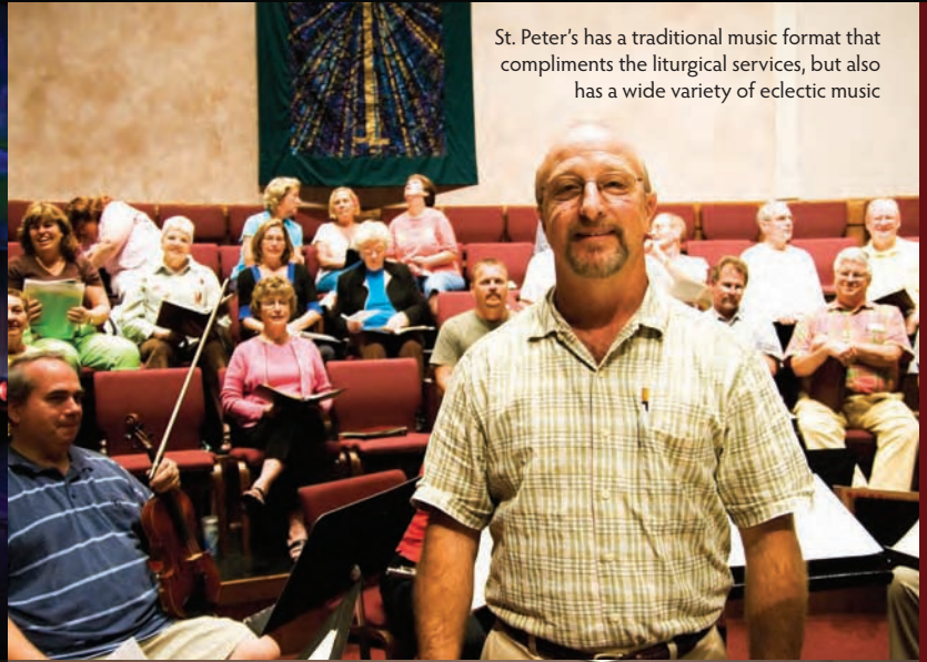
St. Peter's has a traditional music format that compliments the liturgical services, but also has a wide variety of eclectic music