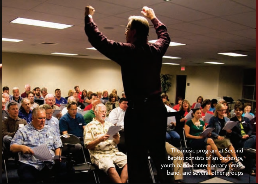
The music program at Second Baptist consists of an orchestra, youth band, contemporary praise band, and several other groups