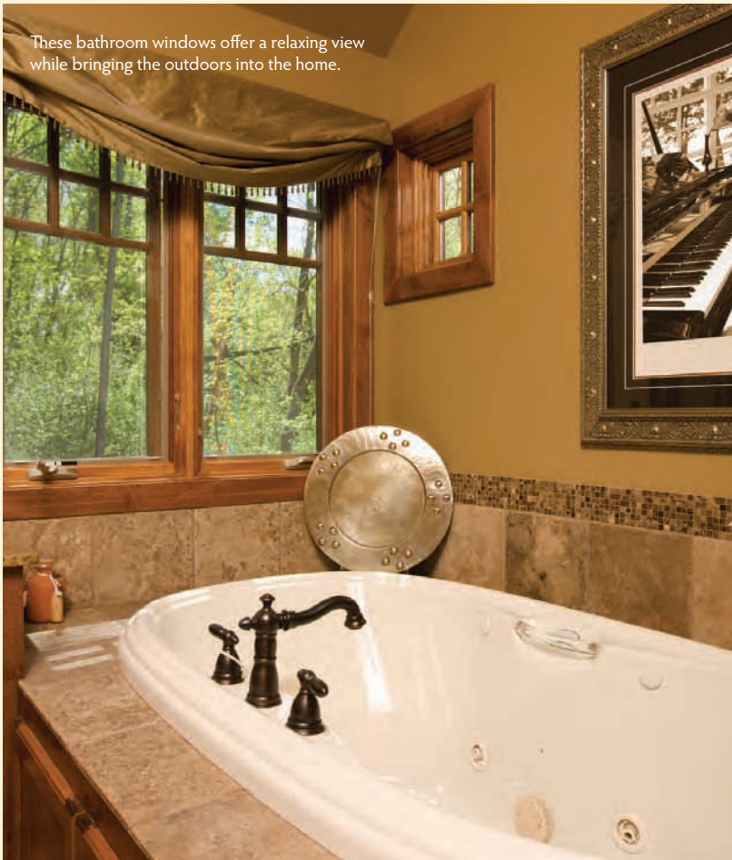
These bathroom windows offer a relaxing view while bringing the outdoors into the home.