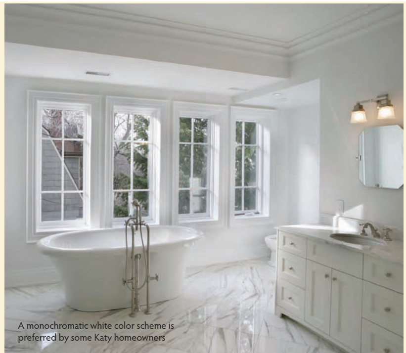
A monochromatic white color scheme is preferred by some Katy homeowners

WWW.DECORATINGDEN.COM Each franchise independently owned & operated