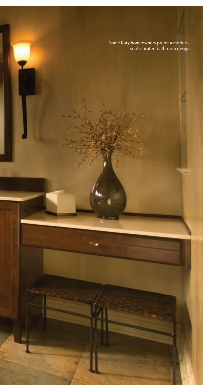
Some Katy homeowners prefer a modern, sophisticated bathroom design