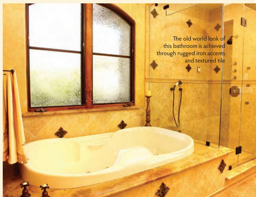
The old world look of this bathroom is achieved through rugged iron accents and textured tile

determining how much to spend on such a project. “The remodeling should be proportional to the home’s value,” she says. Bautista also recommends you do your homework. “Always get references for whoever you use for remodeling. Be sure you speak with someone; don’t just look at a website. Make a phone call. And always get two bids,” she advises.