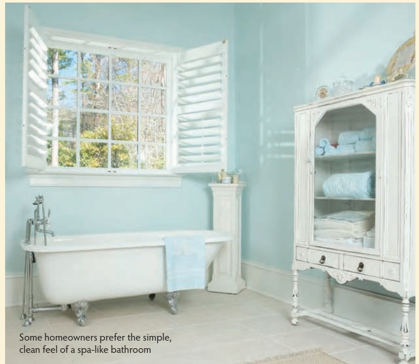
Some homeowners prefer the simple, clean feel of a spa-like bathroom