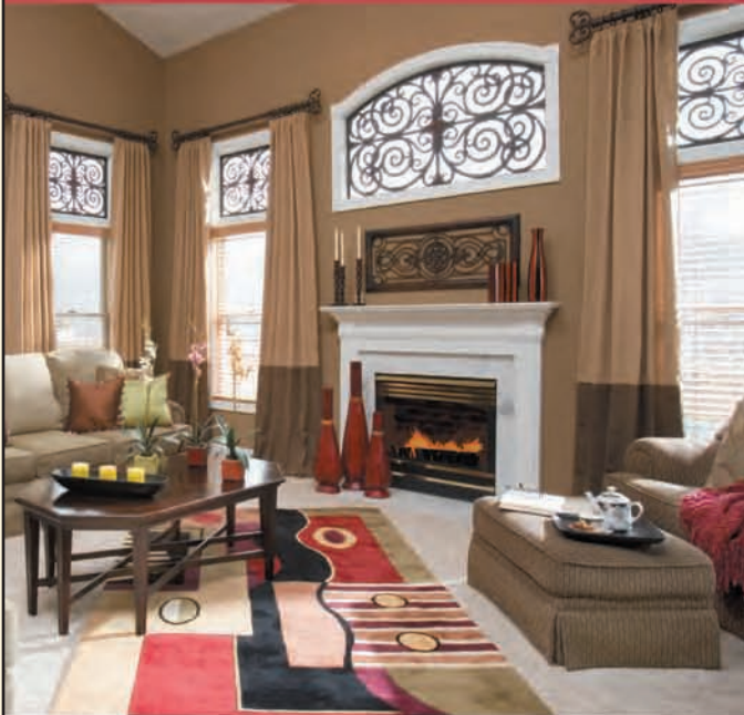
Window Treatments • Furniture • Lighting • Accessories • Floor Coverings

We'll come to you with custom design products to fit your style and budget.