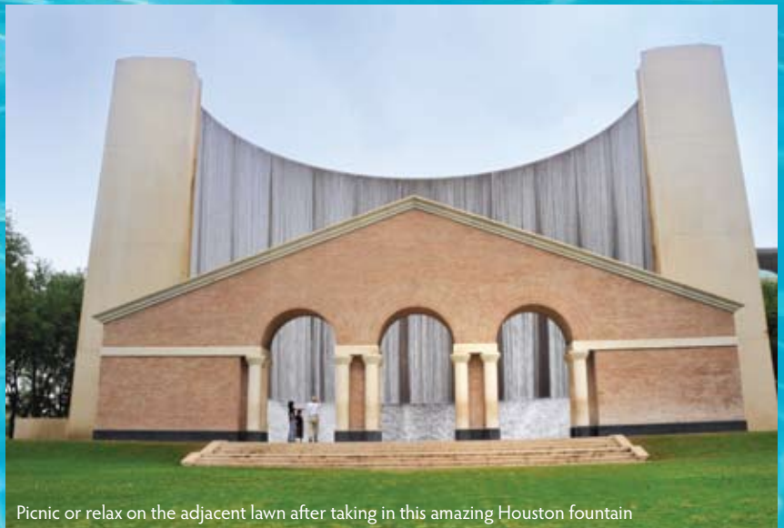
Picnic or relax on the adjacent lawn after taking in this amazing Houston fountain

If you are planning a shopping trip to the Galleria, and have the kids along, what better way to keep them happy than to stop at this amazing water wall. With thousands of gallons of water spilling down every minute, you'll want to have your camera handy for this Houston visual effect. No, you can't swim or play in it, but it's mesmerizing nonetheless.