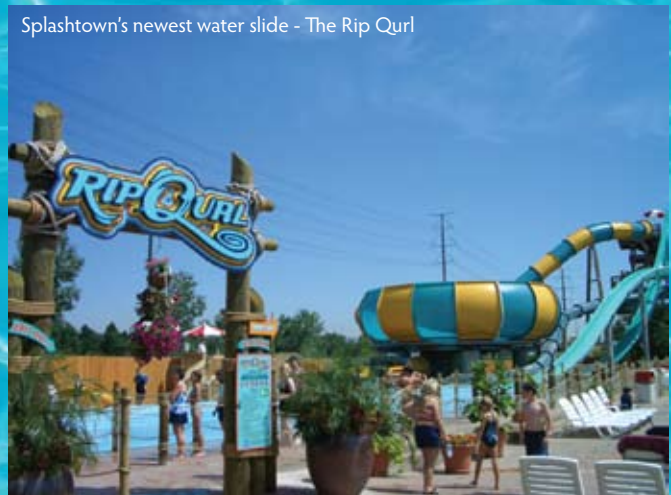
Splashtown's newest water slide - The Rip Curl

Splashtown is the place to be for Katy families. Enjoy dozens of water adventures and acres of splashy rides, slides, chutes, and floats. Splashtown offers everything that your family needs for Wet n Wild fun. "For a day out with the kids, there is no better, or closer, place than Splashtown," says Katy mom Jennifer Wilcox. "It provides me with a little 'mom time' during the summer vacation". Only minutes away from Katy, Splashtown offers a short drive for a day trip with the kids to beat the heat.