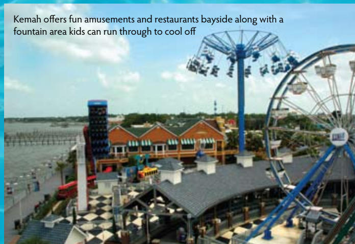
Kemah offers fun amusements and restaurants bayside along with a fountain area kids can run through to cool off