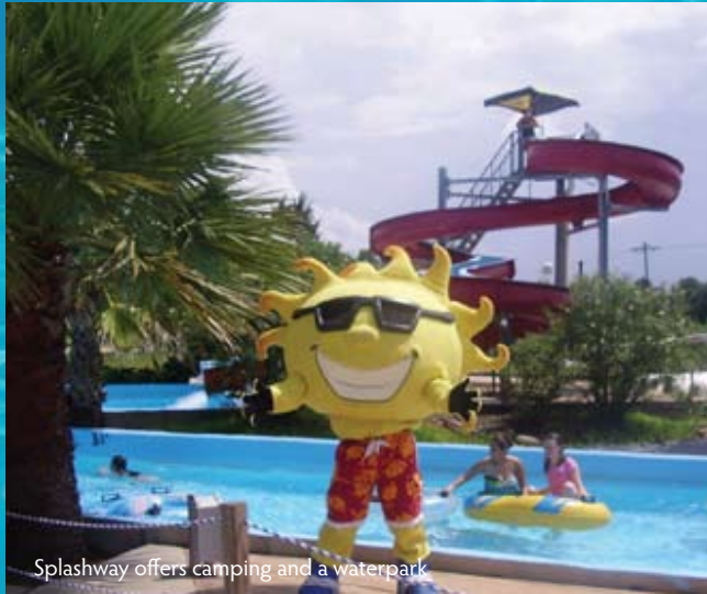
Splashway offers camping and a waterpark