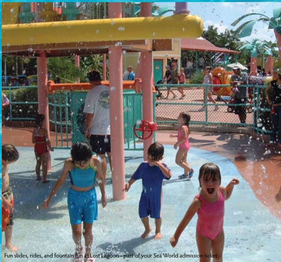
Fun slides, rides, and fountain fun at Lost Lagoon - part of your Sea World admission ticket