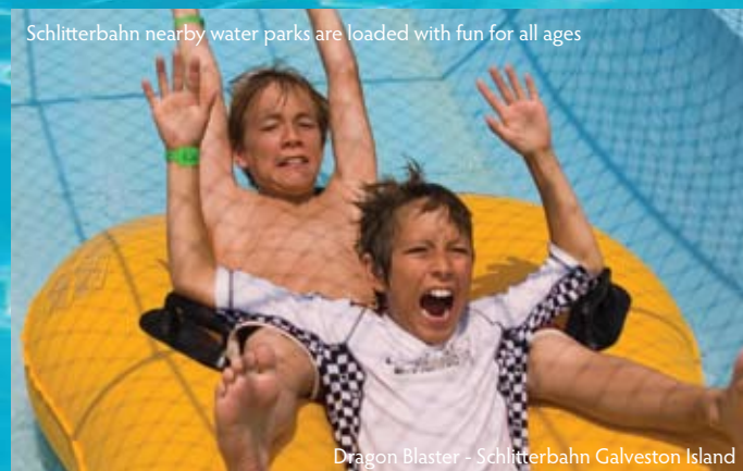
Schlitterbahn nearby water parks are loaded with fun for all ages

Down at the Kemah Boardwalk, there's more than you can enjoy in a day. From carnival rides to great shopping, your kids will have fun while you shop till you drop! There are also several great restaurants to choose from, and a view of the bay that's spectacular. For some water action, head to the center of the boardwalk and enjoy the water fountains that you can actually walk through!