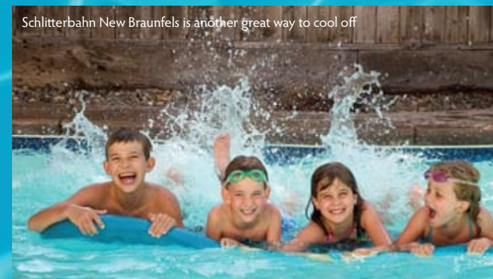
Schlitterbahn New Braunfels is another great way to cool off