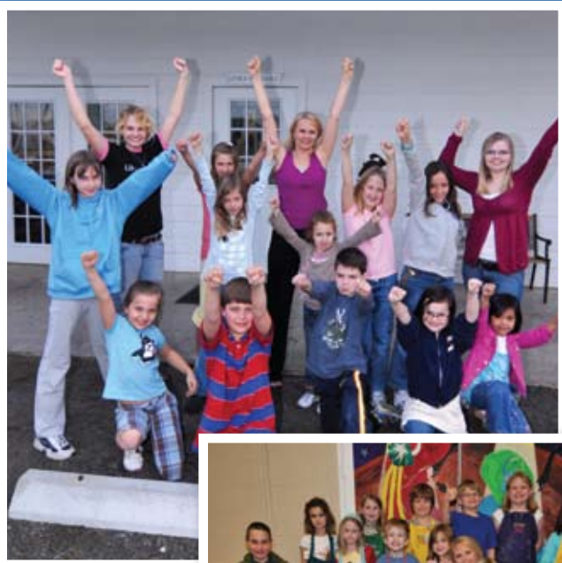
Having fun at KVPAC