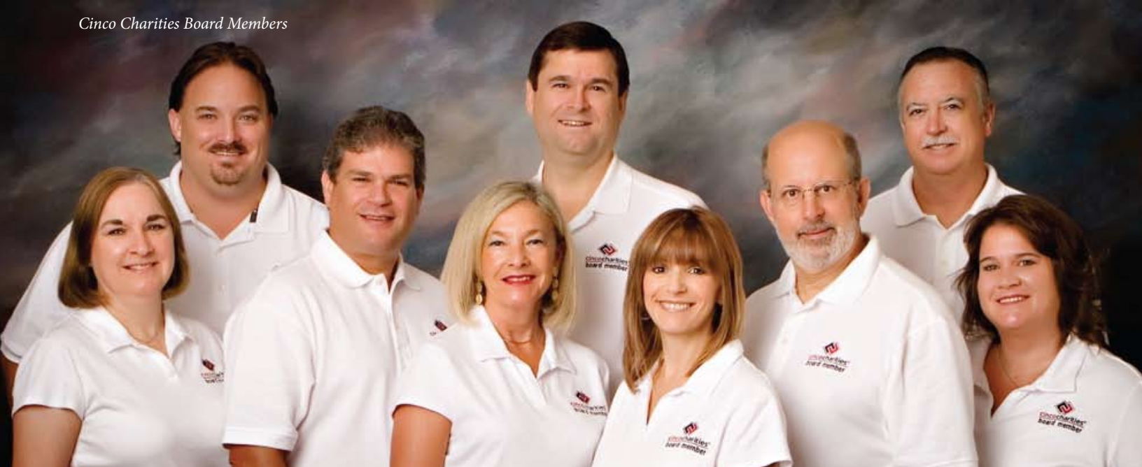
Cinco Charities Board Members

Building a Community of Care and Support in Katy