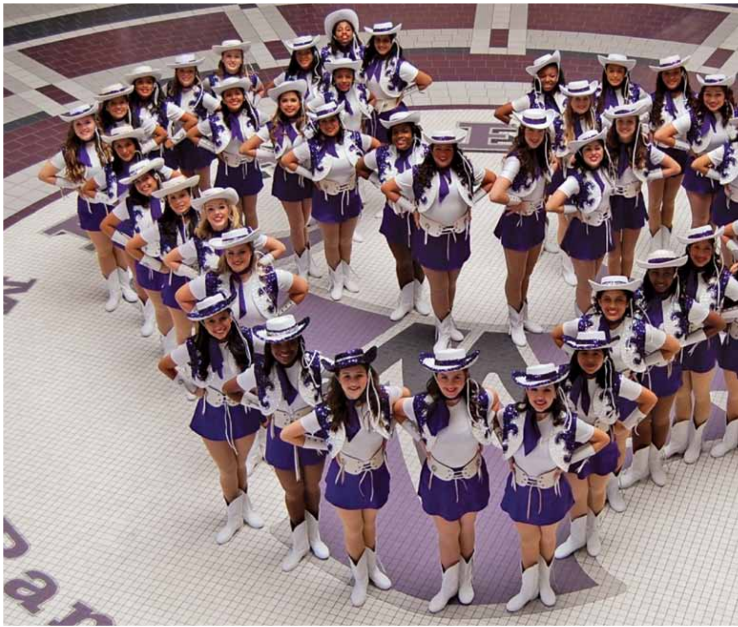
The Belles recently purchased school supplies to help younger Katy students get the year off to a good start