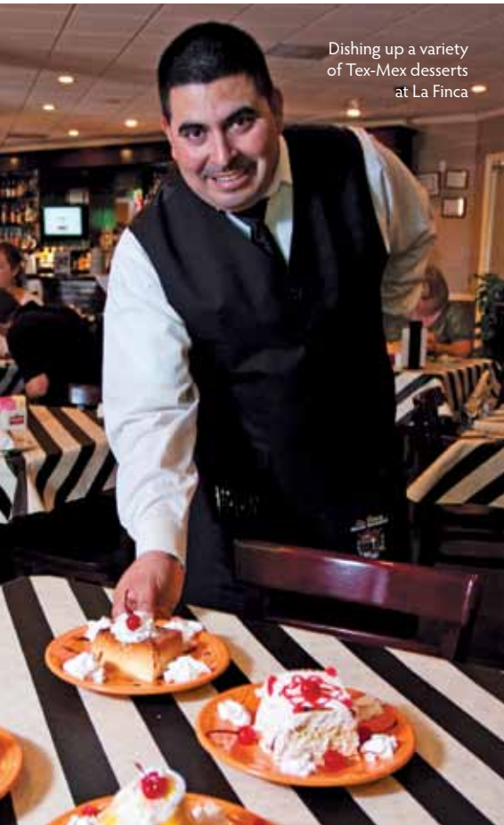
Dishing up a variety of Tex-Mex desserts at La Finca

Texans sure do love good Mexican food, and here in Katy, you don't have to go far to find it. With so many tantalizing Mexican restaurants to choose from, it's hard to decide where to go. In addition to great food, many Katy eateries offer a vibrant atmosphere with fun, colorful décor, friendly service, and lively Mariachi music. It's more than just a meal – it's a fiesta! Check out these local spots for some of Katy's best-kept Mexican food secrets that promise delicious results.