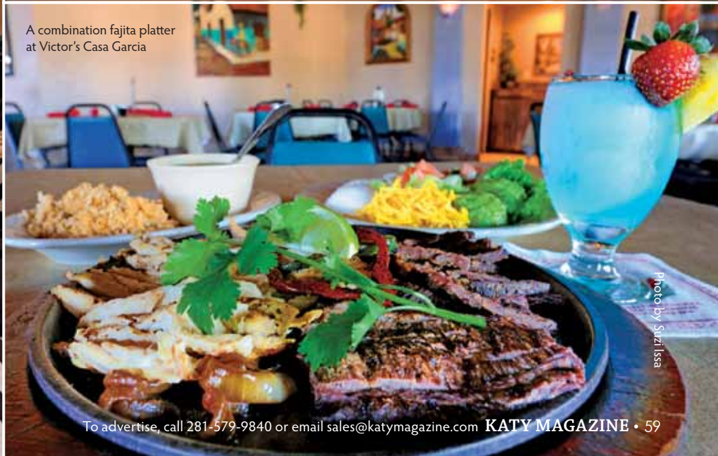
A combination fajita platter at Victor's Casa Garcia