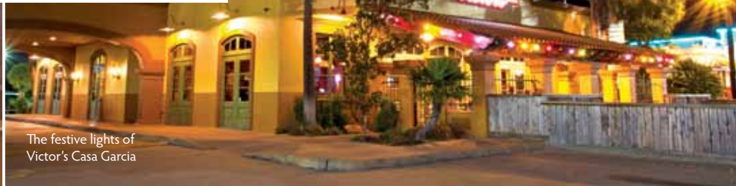
The festive lights of Victor's Casa Garcia