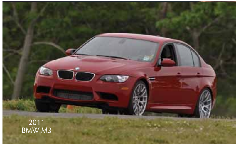
2011 BMW M3