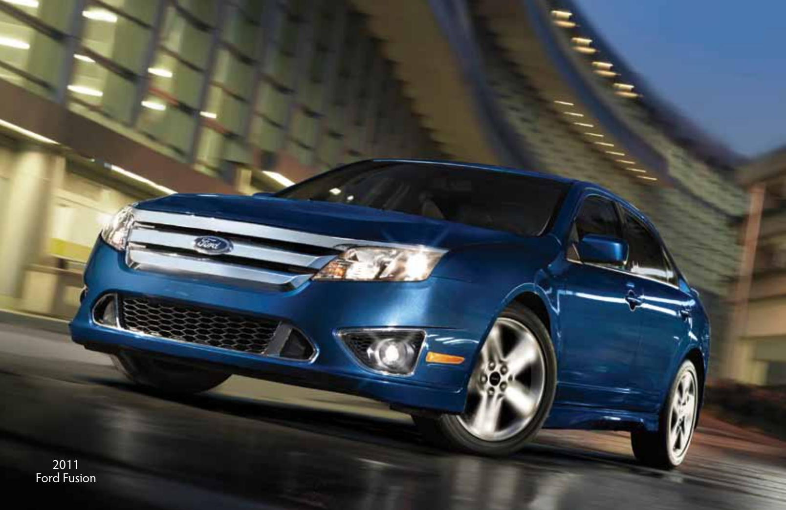
2011 Ford Fusion