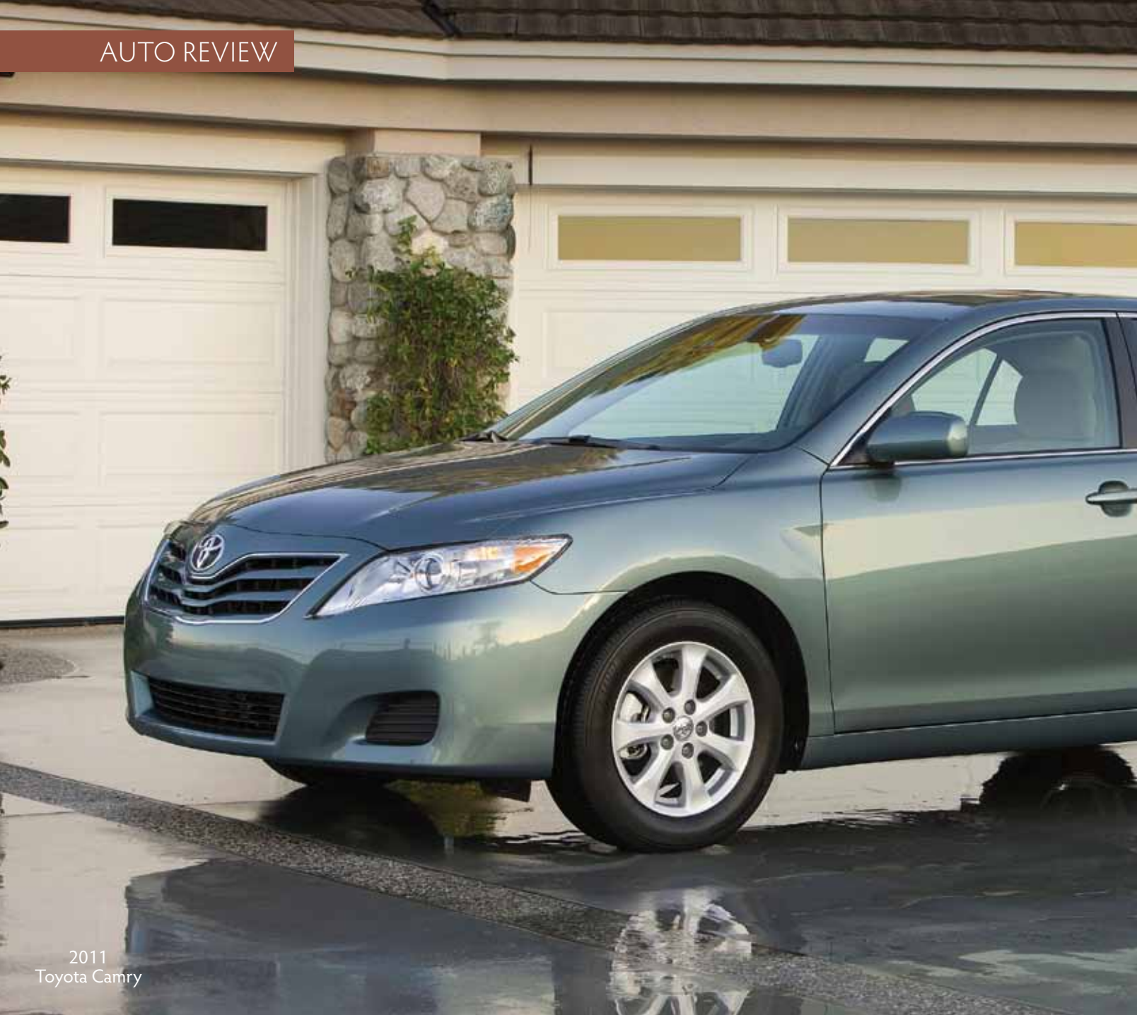
2011 Toyota Camry