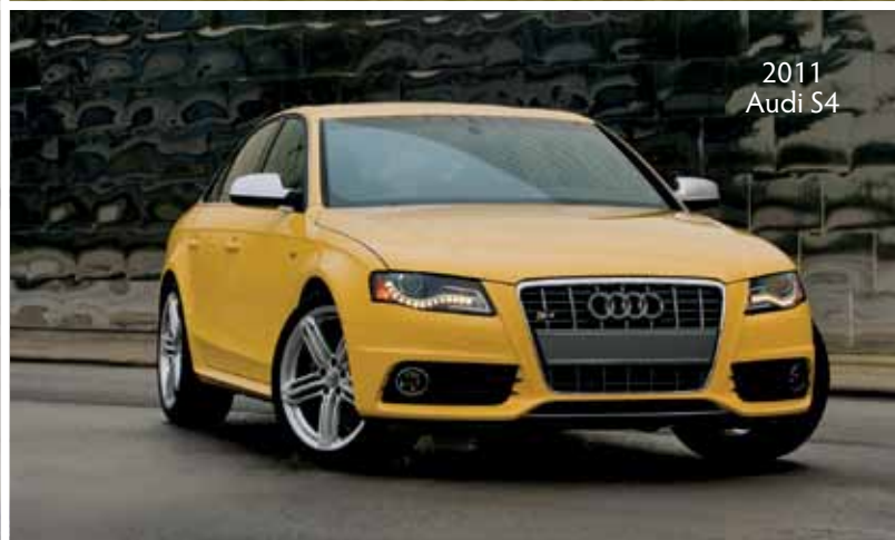
2011 Audi S4

The ever-popular sedan still rules Katy's roads, offering both a sporty and family-friendly ride. In the thick of summer driving season, what better time to take a look at some of the hottest and newest models zooming around Katy?