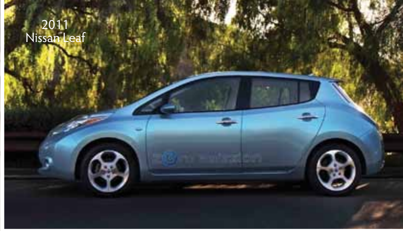
2011 Nissan Leaf