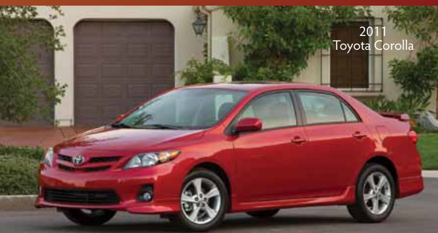
2011 Toyota Corolla

sleek, composite headlights, and blacked-out lower valance with large, incorporated fog lamps, the car has an overall pricier, more sophisticated look. The interior didn't escape the designer's attention, either. Layout is driver-friendly, and even though there is an abundance of plastic utilized on the dash, it tends to disappear with the extensive use of color and incorporation with the center stack.