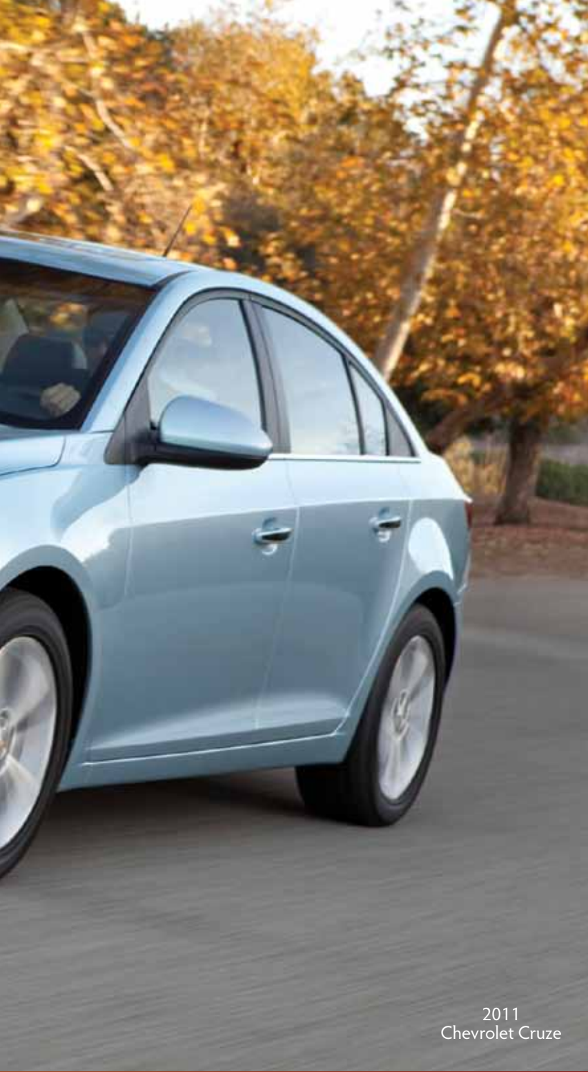
2011 Chevrolet Cruze