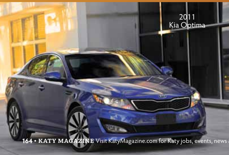
2011 Kia Optima

Although Kia may have been known for... well, uh... a great warranty, styling was pretty much from the town of Dullsville. Welcome the 2011 Optima, Kia's point of light in an almost completely redesigned lineup that has sparked new interest in the brand. One of the most compelling reasons for increased showroom traffic is Optima's bodywork. From the new corporate-look grille,