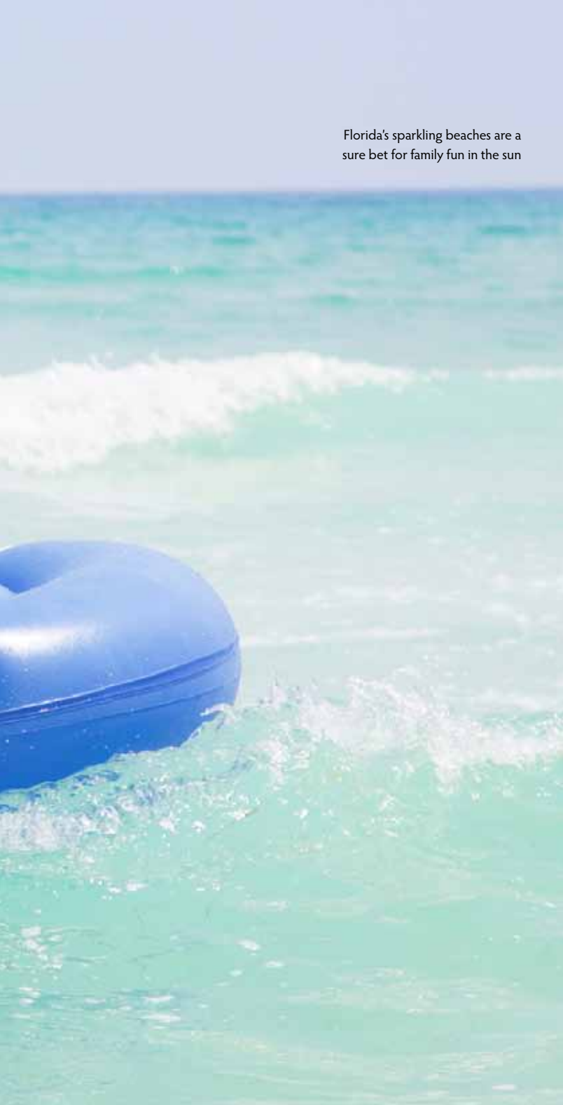
Florida's sparkling beaches are a sure bet for family fun in the sun