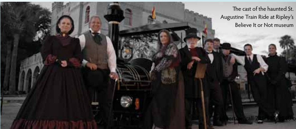
The cast of the haunted St. Augustine Train Ride at Ripley's Believe It or Not museum