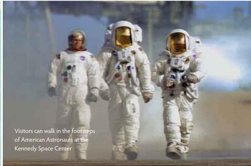
Visitors can walk in the footsteps of American Astronauts at the Kennedy Space Center