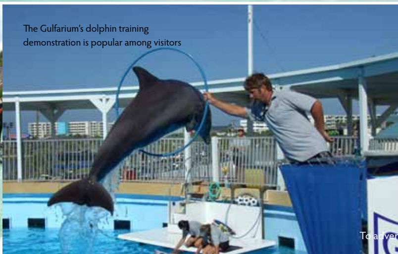
The Gulfarium's dolphin training demonstration is popular among visitors