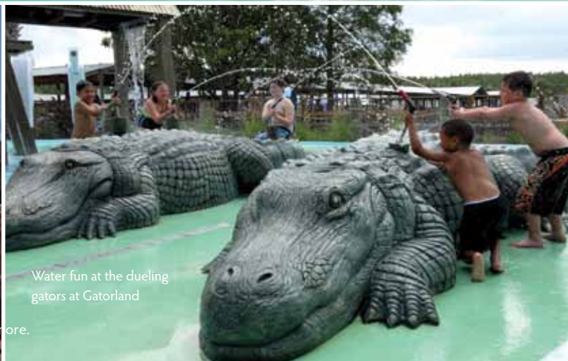
Water fun at the dueling gators at Gatorland