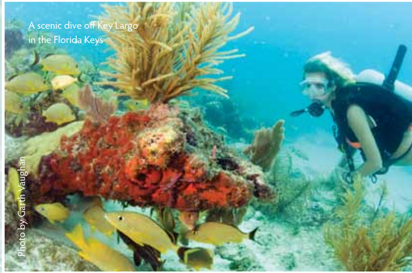
A scenic dive off Key Largo in the Florida Keys