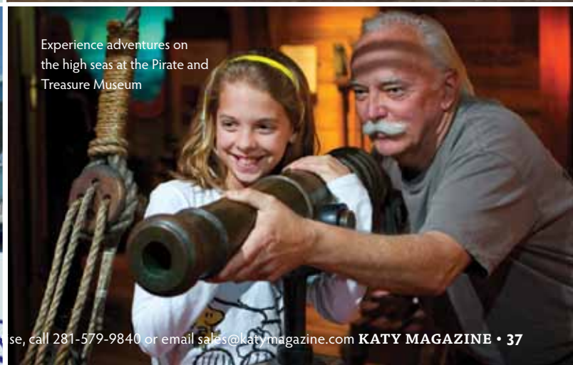
Experience adventures on the high seas at the Pirate and Treasure Museum