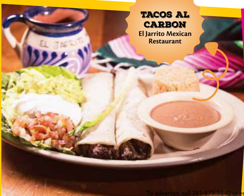
TACOS AL CARBON El Jarrito Mexican Restaurant

Known for their authentic fire-grilled chicken, El Pollo Loco appeals to fans with their grande avocado taco. Hand-sliced avocados, jack cheese, pico de gallo, cabbage, chicken, and cilantro dressing are tucked into artisan tortillas. Also be sure to sample the chicken taco al carbon made with corn tortillas, chopped citrus-marinated fire-grilled chicken, diced onion, and cilantro. Grab just one, or make it a meal and get three.