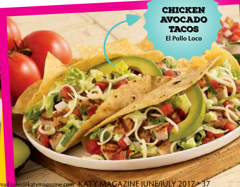
CHICKEN AVOCADO TACOS El Pollo Loco