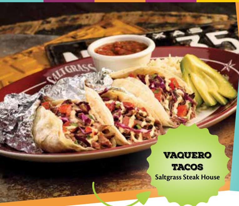
VAQUERO TACOS Saltgrass Steak House