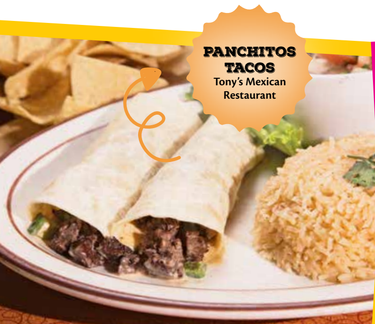
PANCHITOS TACOS Tony's Mexican Restaurant

At Tacos y Tortas Adrian, all taco plates come with five corn tortilla tacos, making it a stellar deal. Try their Adrian plate with seasoned beef steak tacos, or make it a super Adrian and get your tacos topped with sour cream, queso fresco, and avocado. Another fan favorite is the Al Pastor featuring seasoned pork and pineapple.