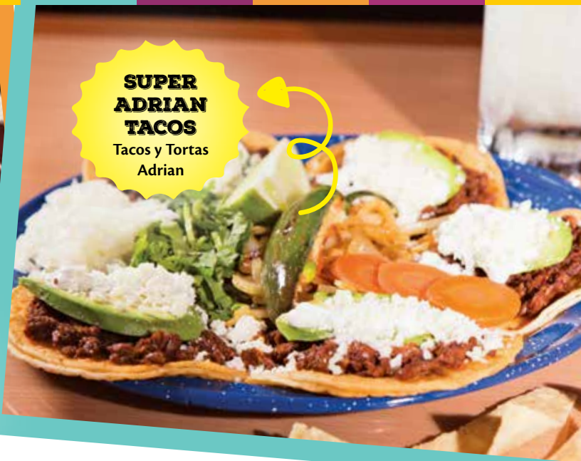
SUPER ADRIAN TACOS Tacos y Tortas Adrian