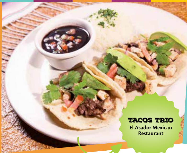
TACOS TRIO El Asador Mexican Restaurant