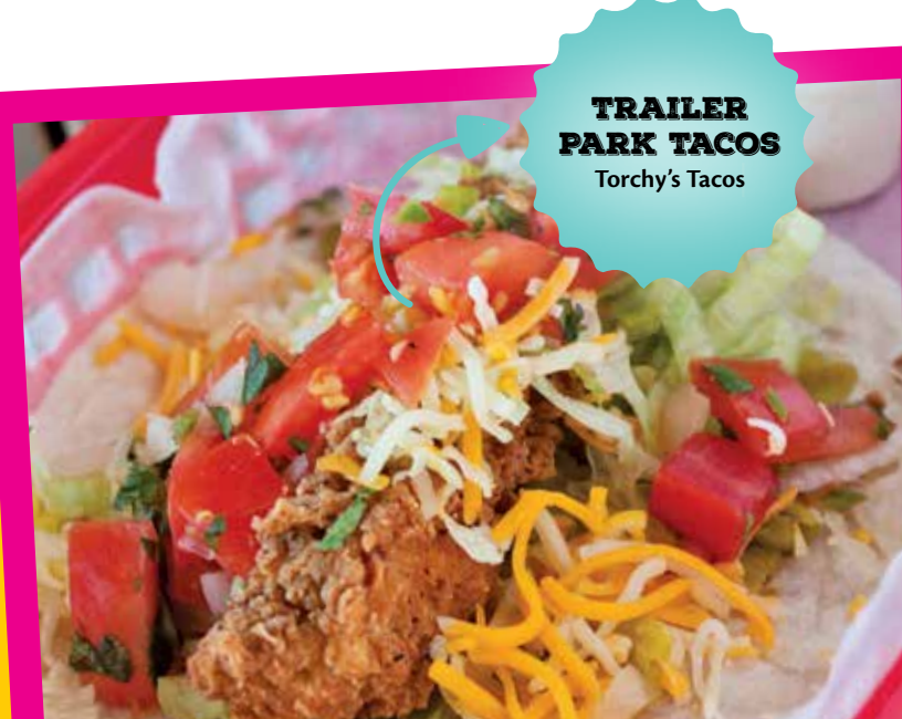
TRAILER PARK TACOS Torchy's Tacos