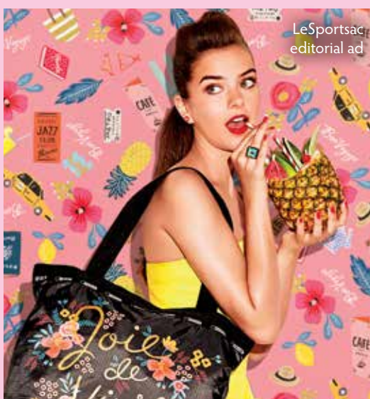
LeSportsac editorial ad