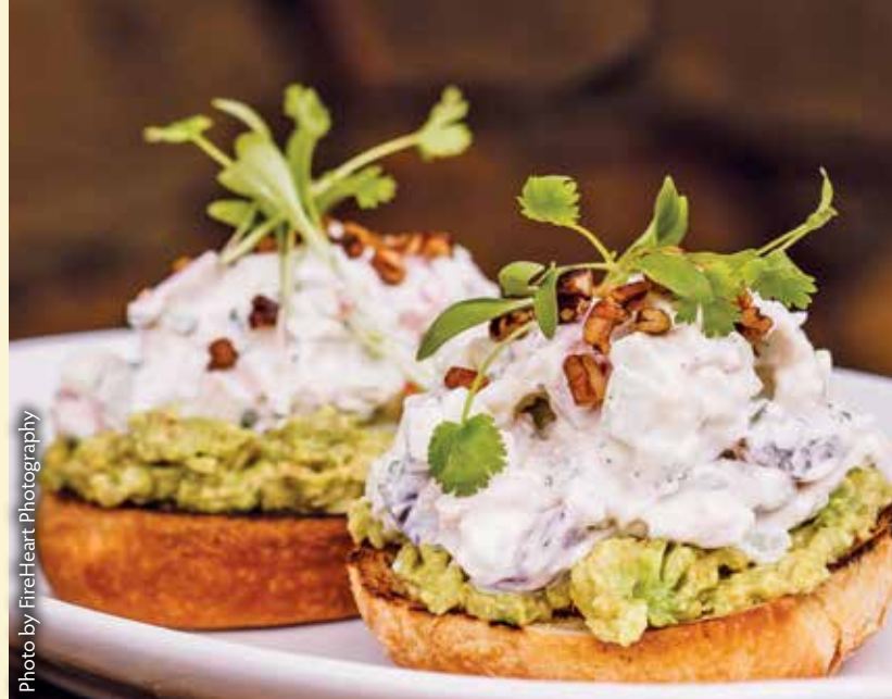
Agave Rio's Chicken Salad

deep fried garlic mashed potatoes steal the show. Feeling adventurous? Try a beverage made with jalapeño-infused vodka, and all day Sunday enjoy happy hour pricing on select martinis, house wine, and sangria. Their buffet is only available on Sundays.