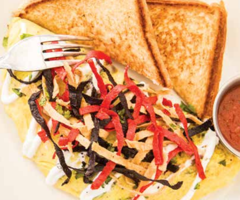
Black Walnut Cafe's Omelet