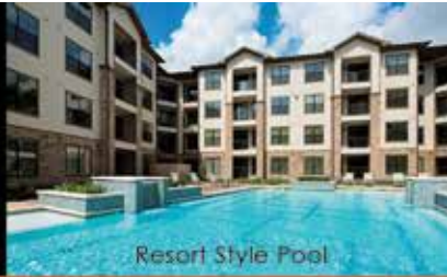
Resort Style Pool