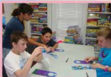
Premier Academy 8:30-3:30

Highly acclaimed therapy programs for children with special needs.