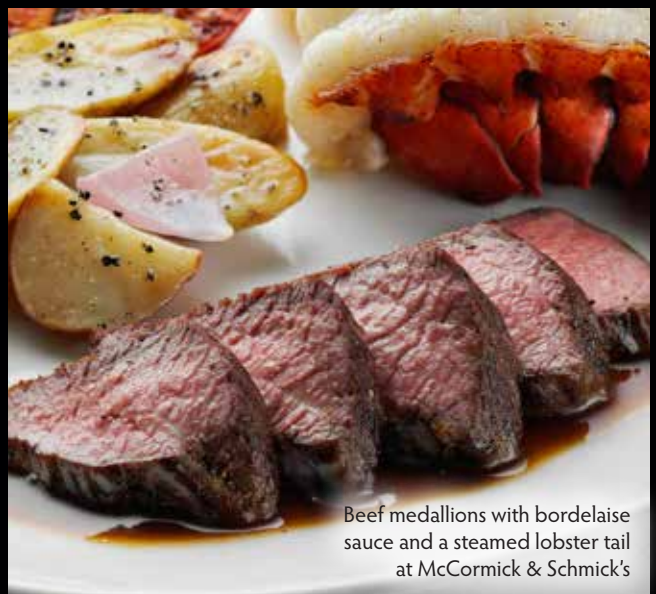
Beef medallions with bordelaise sauce and a steamed lobster tail at McCormick & Schmick's