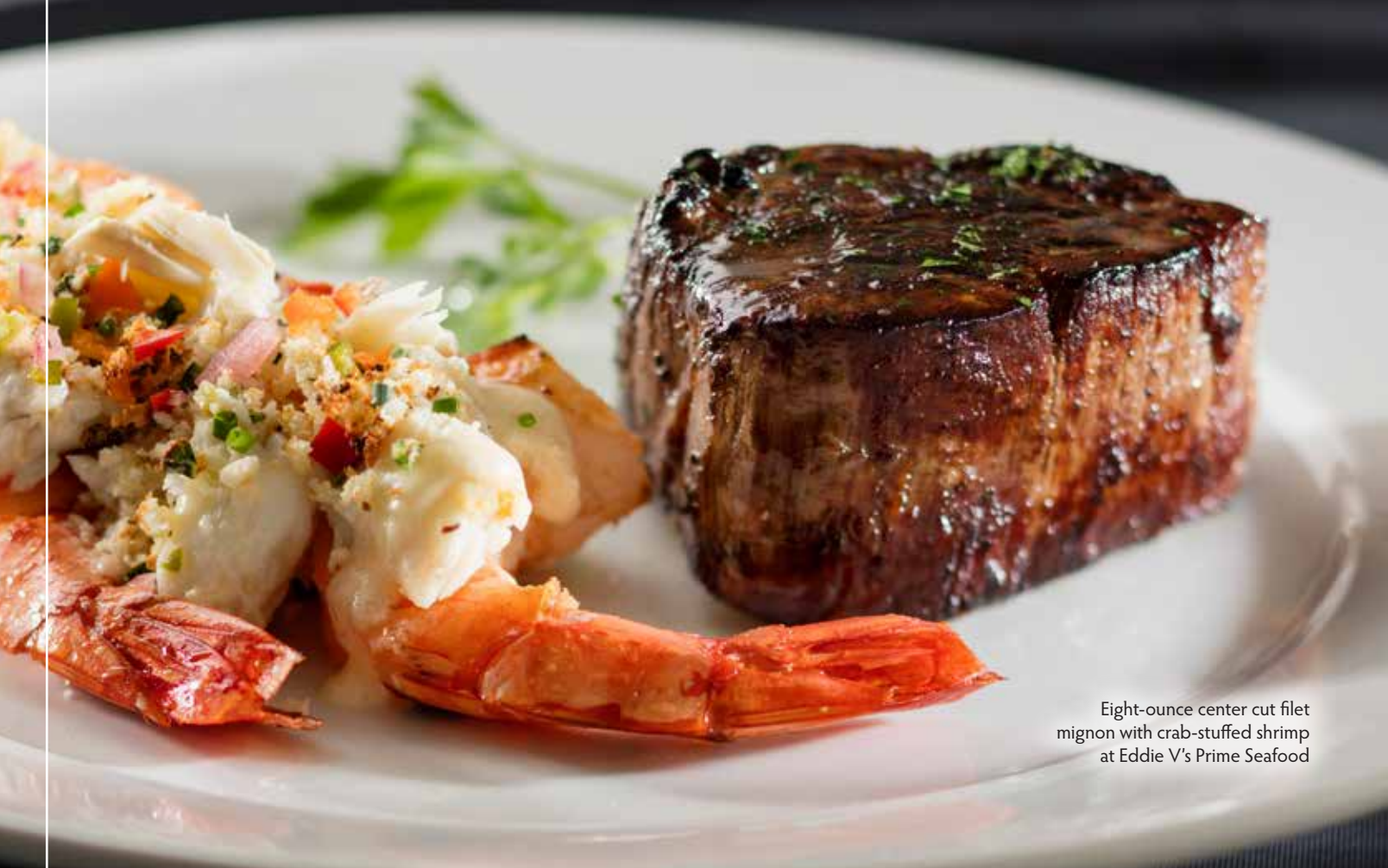
Eight-ounce center cut filet mignon with crab-stuffed shrimp at Eddie V's Prime Seafood

There are few things as tempting as a perfectly seasoned steak simmering over a grill. Whether your palate begs for a bone-in ribeye or a delicate filet mignon, your inner foodie will be highly satisfied by these prime beef treats delivered with white-glove service.