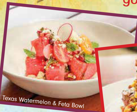
Texas Watermelon & Feta Bowl