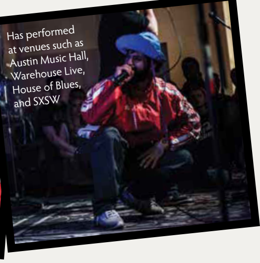
Has performed at venues such as Austin Music Hall, Warehouse Live, House of Blues, and SXSW