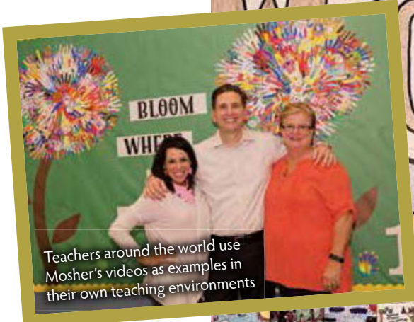
Teachers around the world use Mosher's videos as examples in their own teaching environments