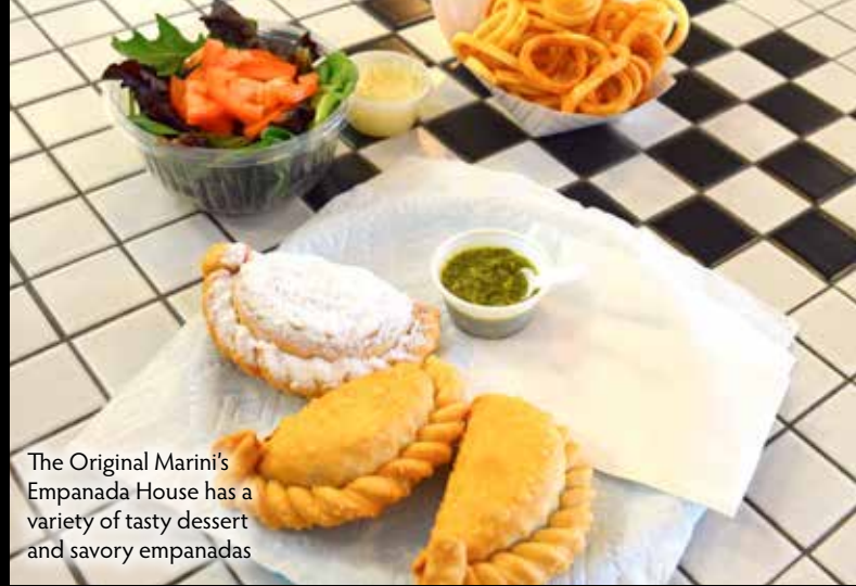
The Original Marini's Empanada House has a variety of tasty dessert and savory empanadas

It's easy to overlook this delicious taco eatery, but that would be a huge mistake. They offer an array of authentic tacos