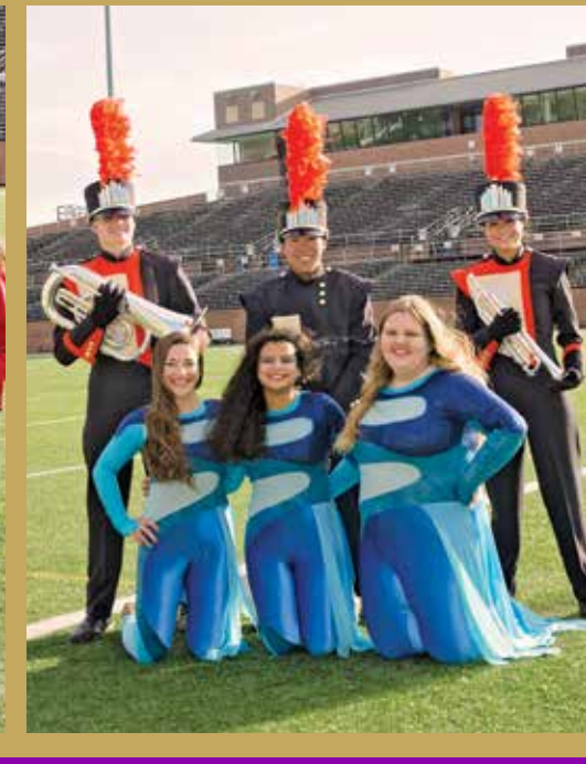
Cinco Ranch band members pride themselves on creating a high-energy environment during games