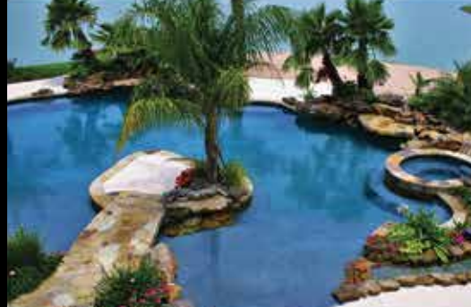
POOLS & SPAS