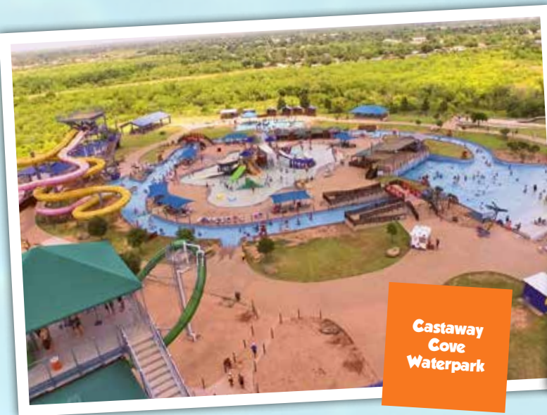
Castaway Cove Waterpark

If you are looking for something a little more thrilling, consider a mini vacay for a summer refresher. We've put together some of the coolest places to splash, play, and get away this season.