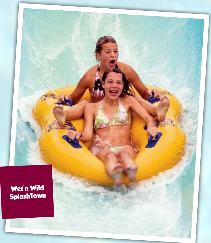
Wet 'n' Wild SplashTown

You won't want to skip a trip to Wet 'n' Wild SplashTown this summer after its recent multi-million dollar renovation. An expanded kids' area is outfitted with several new waterslides, and the pool beach entry area was reconfigured with seat walls so parents can be closer to their children. For the older crowd, new attractions include the Big Kahuna, a five-person serpentine raft ride, and the FlowRider, an exciting surfing experience. Cabana rentals, movies at the wave pool, and live entertainment are among other perks of this nearby waterpark. KM