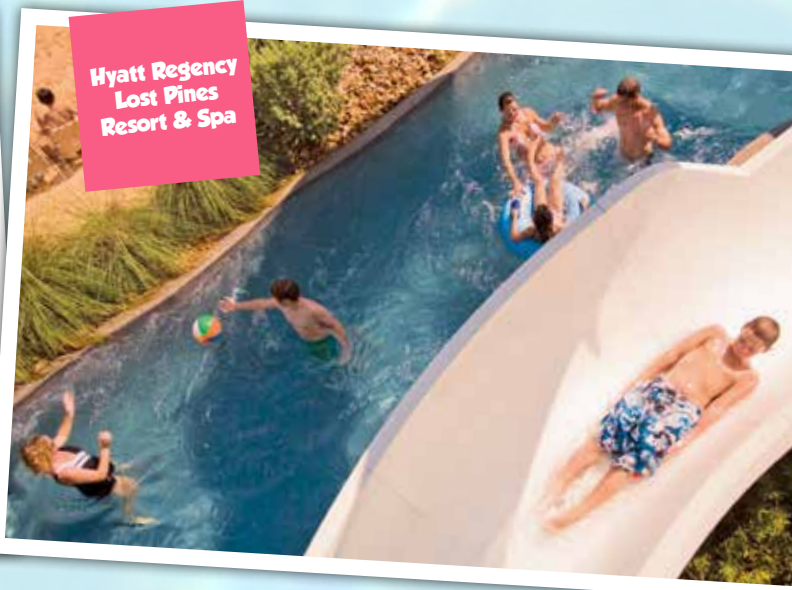
Hyatt Regency Lost Pines Resort & Spa