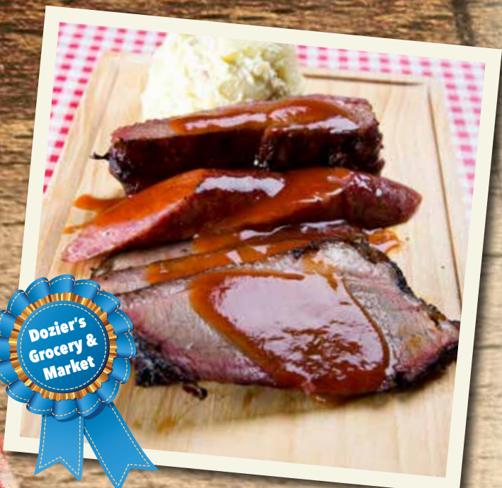
Dozier's Grocery & Market

cheddar sausage. Don't forget their smokehouse salad which tops a bed of romaine lettuce with shredded cheddar, fried onion tangles, chopped beef brisket, and ranch dressing.