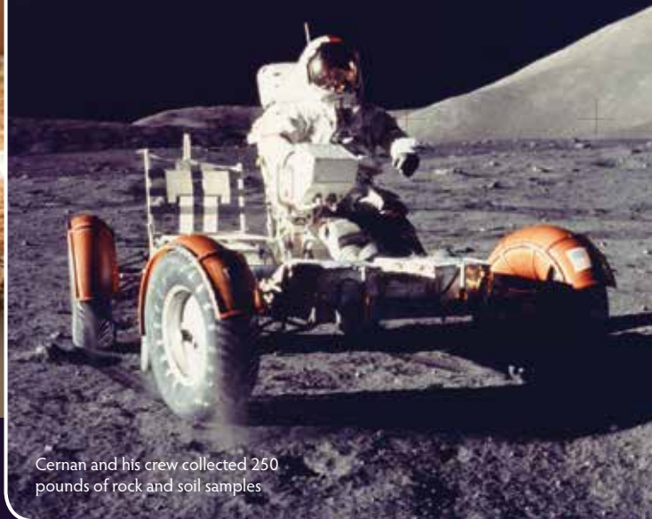
Cernan and his crew collected 250 pounds of rock and soil samples

Cernan served as the Apollo 10 lunar module pilot and flew the module 10 miles of the moon's surface on an important pre-flight for the Apollo 11 lunar landing.