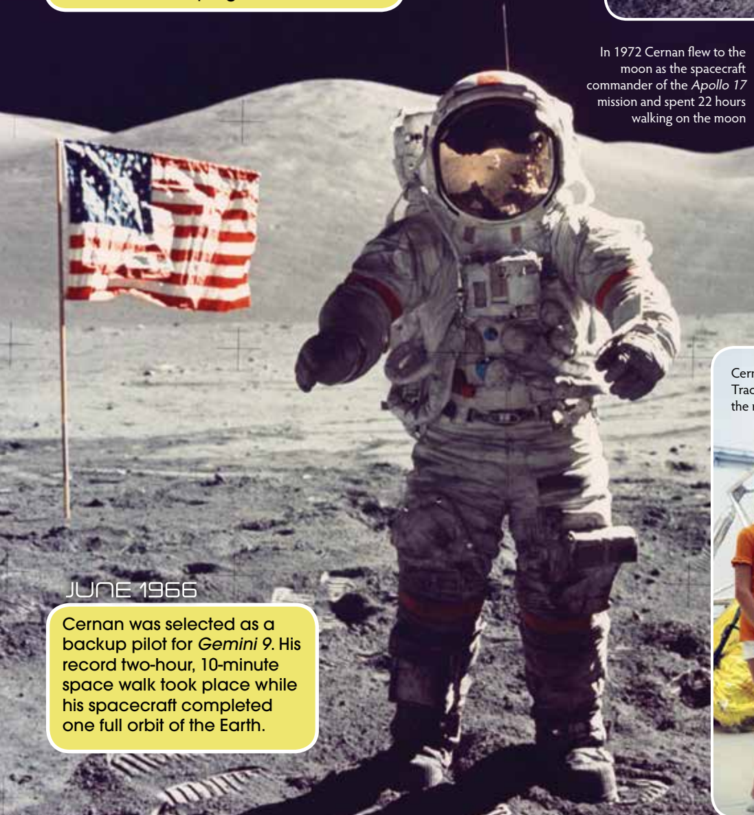
In 1972 Cernan flew to the moon as the spacecraft commander of the Apollo 17 mission and spent 22 hours walking on the moon

Cernan was among the third group of men selected by NASA to participate in the astronaut program.