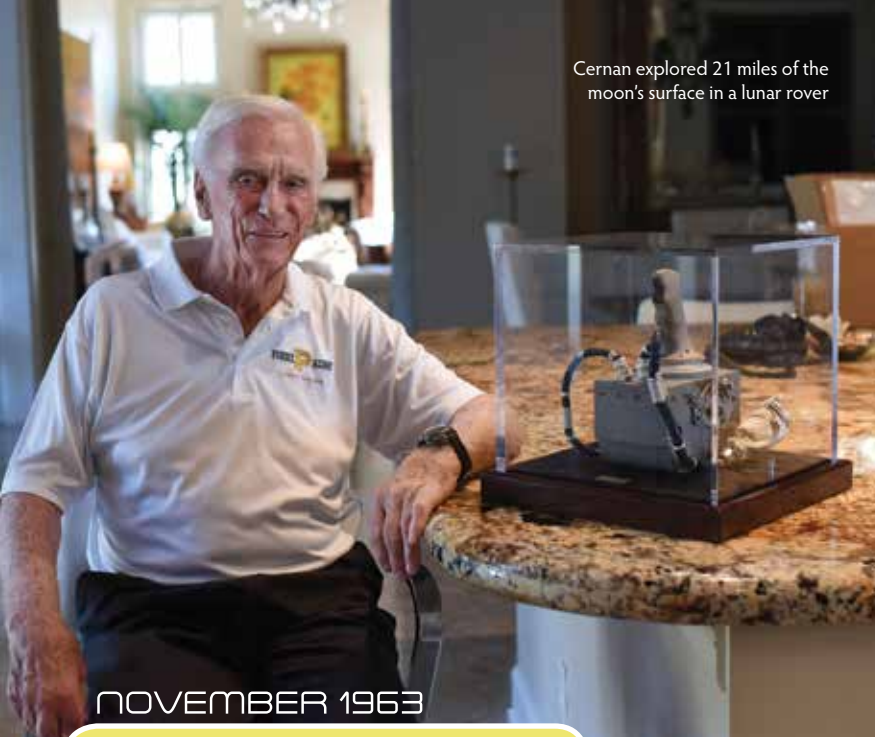
Cernan explored 21 miles of the moon's surface in a lunar rover