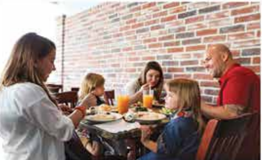
*Free chicken kids meal, Kids 12 & under, with purchase of adult entrée, dine-in only, 4-8 pm, limit 2 per family.*