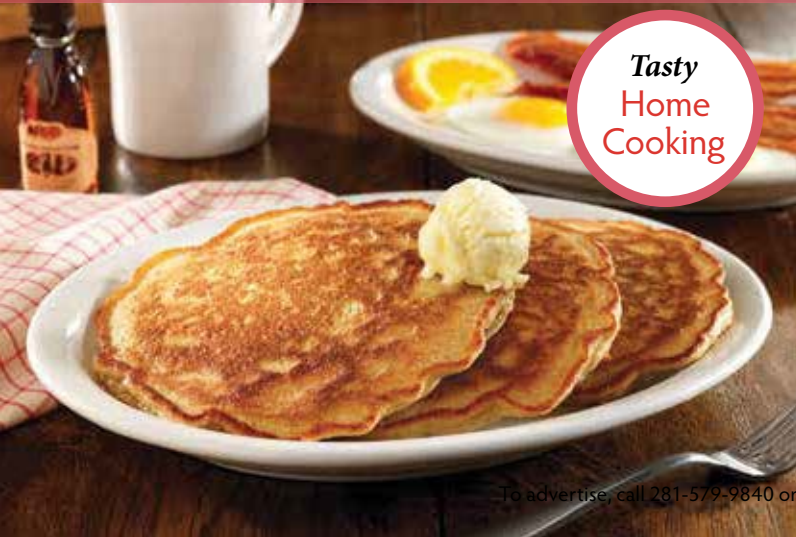
Mama's pancake breakfast at Cracker Barrel

With pancake stacks that look more like a decadent dessert, IHOP is an old standby for breakfast any time of the day. The New York cheesecake pancakes with real cheesecake pieces cooked inside are a delectable choice. Craig Hoffman, a marketing rep for IHOP says, "They come topped with strawberries in glaze, powdered sugar, and whipped topping."