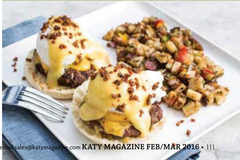
Bacon cheeseburger Benedict at Black Walnut Café