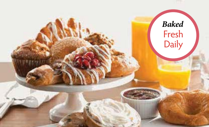
Assorted pastries at Panera Bread