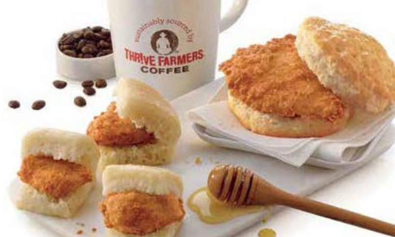
Chick-n-minis and a chicken biscuit at Chick-fil-A

Another sweet delight is the French toast at IHOP. "We're always coming up with new and innovative recipes to please our customers," Hoffman adds. "We have several French toast varieties to choose from, all made with our vanilla, cinnamon, and real cream batter." The stuffed French toast starts with cinnamon raisin toast stuffed with cream filling, topped with a choice of fruit.