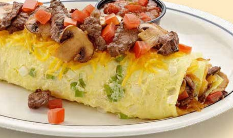
Big steak omelet at IHOP