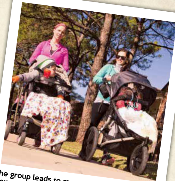
The group leads to meaningful friendships and exposure to the outdoors which helps with common issues like postpartum depression