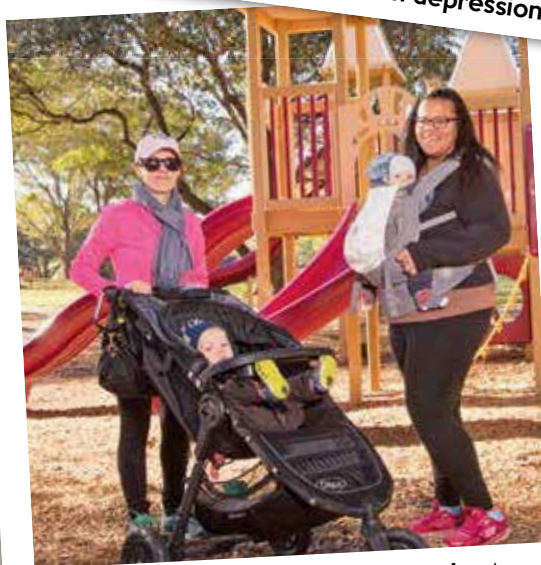
Hike it Baby has special field trips to Discovery Green, the Children's Museum of Houston, and more