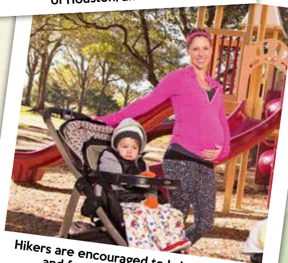
Hikers are encouraged to bring their kids and family members of all ages