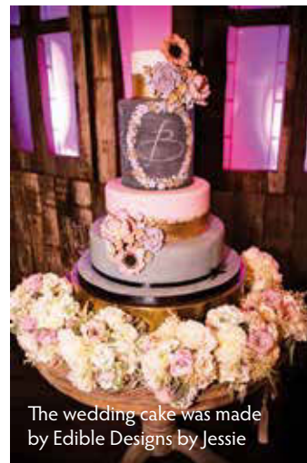
The wedding cake was made by Edible Designs by Jessie