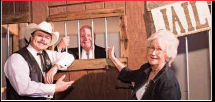
Fort Bend County VIPs and honored guests showed off their best cowboy attire at Safari Texas Ranch to benefit programs like Katy Christian Ministries, the Lone Star Veterans Association, and more